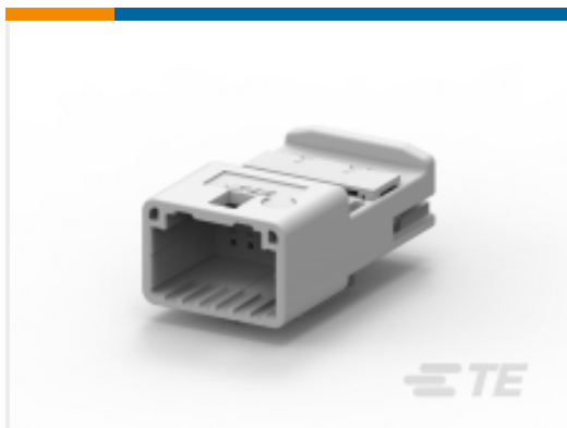
TE Part #1379675-5 12W TAB HSG ASSY NATURAL