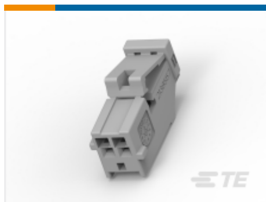
TE Part #2138557-2 2P GENERATION Y Plug, Single-P