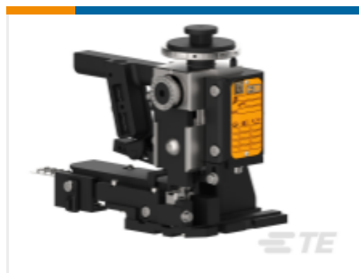
TE Part #2837157-1 OCEAN_2.0_Applicator-S-110F1550