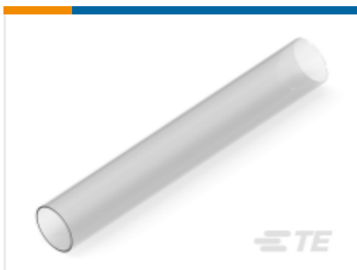
TE Part #EM58926001 RBK-VWS-125-NR1-X-30MM