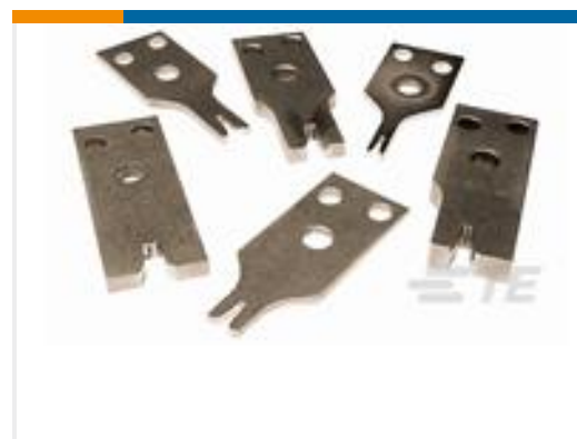
TE Part #7-568176-0 CRIMPER, WIRE (.050" 'F')