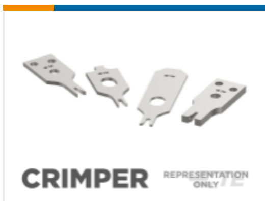
TE Part #2-1803224-4 CRIMPER,WIRE F