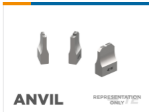
TE Part #1803426-2 ANVIL, COMBINATION, NO JOG, END FEED