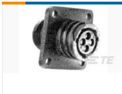
TE Part #206430-1 RECEPT, SZ 11-4, CPC