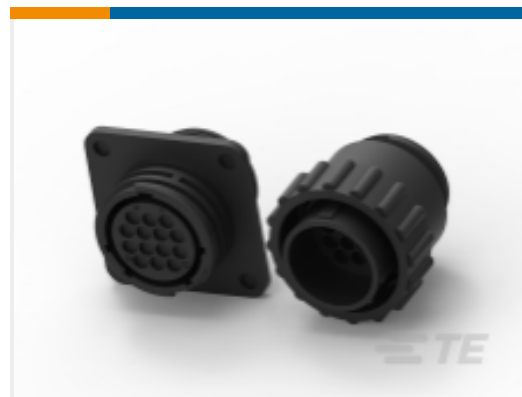
TE Part #206150-1 Circular Connector, Environmentally Sealed, CPC Series 6