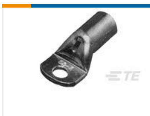
TE Part #709821-3 XCT 150-12