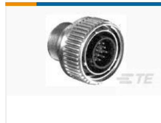
TE Part #208486-3 CMC PLUG ASSEMBLY, SZ 22