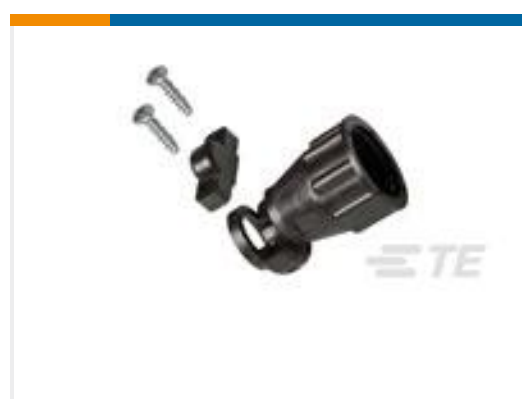
TE Part #1-206062-6 CABLE CLAMP KIT #11