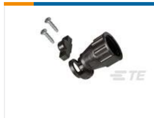
TE Part #1-206062-4 CABLE CLAMP KIT #11