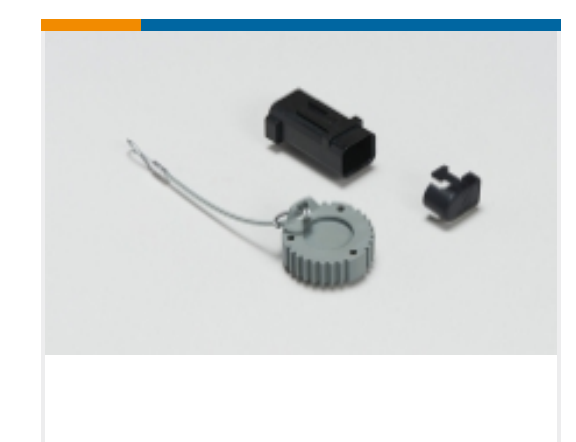
Automotive Connector Caps & Covers (4)