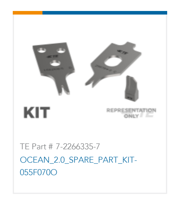
Also in the Series | AMP Type III+