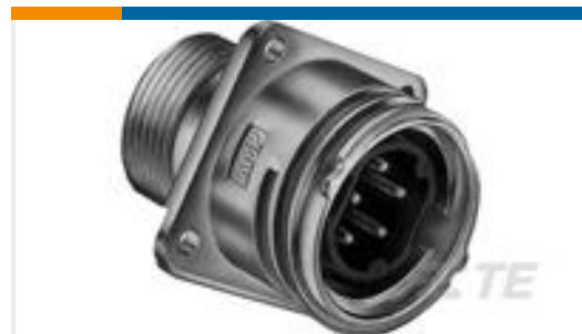
TE Part #208719-1 RECEPT ASSY,SZ 14,CPC