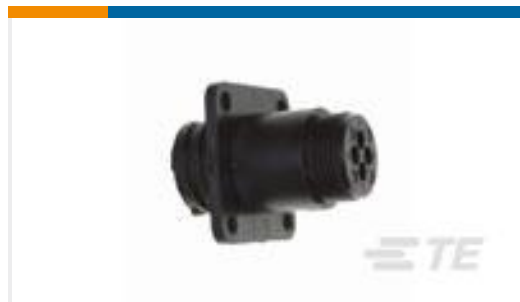
TE Part #206061-1 RECPT, SZ 11-4, CPC