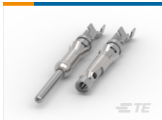
TE Part #66399-3 Pin and Socket Contacts, Type III, LP