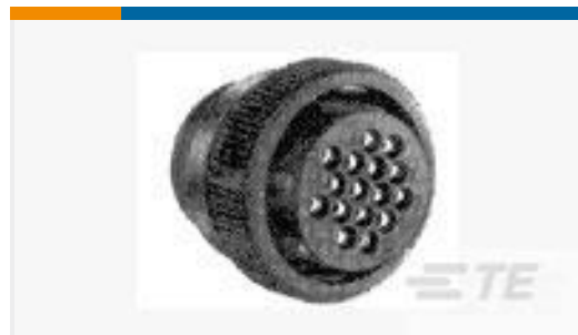
TE Part #206060-1 CPC PLUG ASSEMBLY SIZE 11-4