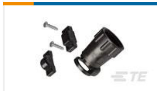
TE Part #206966-7 CABLE SHELL CLAMP SIZE 13