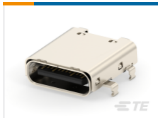
TE Part #2388749-1 USB4 RECPTACLE ON BOARD