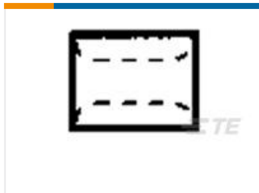
TE Part #323672 SPLICE,SOLIS PARA HT 12-10