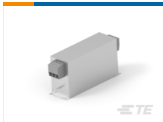
TE Part #2-1609989-5 75BCF10R=F8237E