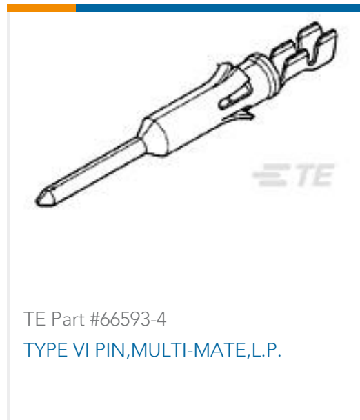
TE Part #66593-4 TYPE VI PIN, MULTI-MATE, L.P.