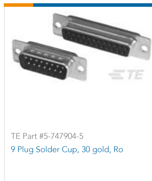
TE Part #5-747904-5 9 Plug Solder Cup, 30 gold, Ro