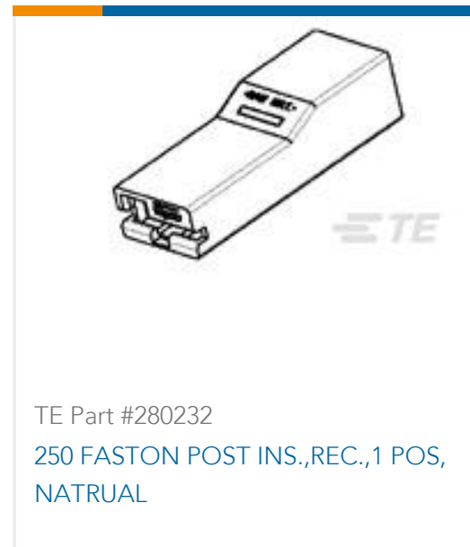
TE Part #280232 250 FASTON POST INS., REC., 1 POS, NATURAL