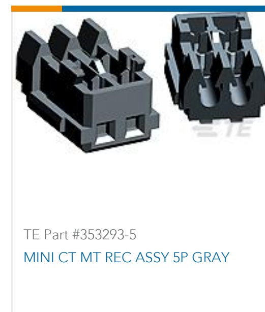
TE Part #353293-5 MINI CT MT REC ASSY 5P GRAY