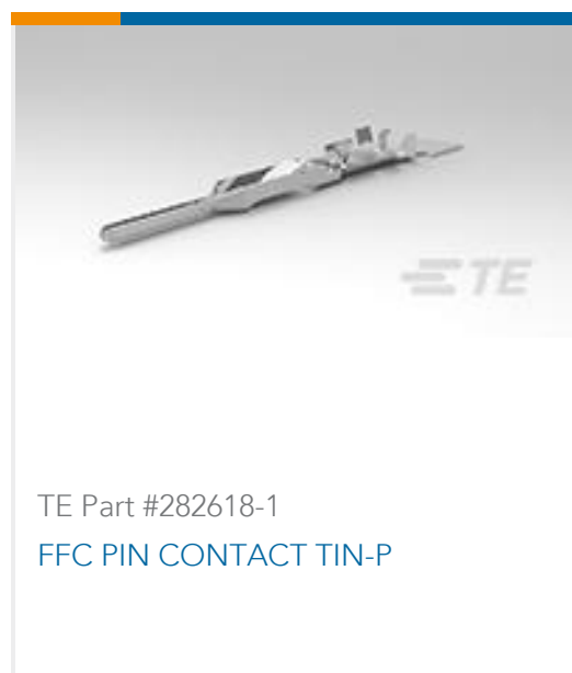
TE Part #282618-1 FFC PIN CONTACT TIN-P