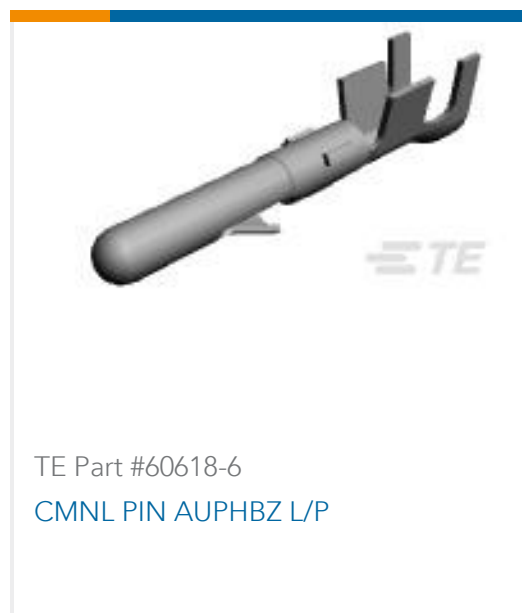
TE Part #60618-6 CMNL PIN AUPHBZ L/P