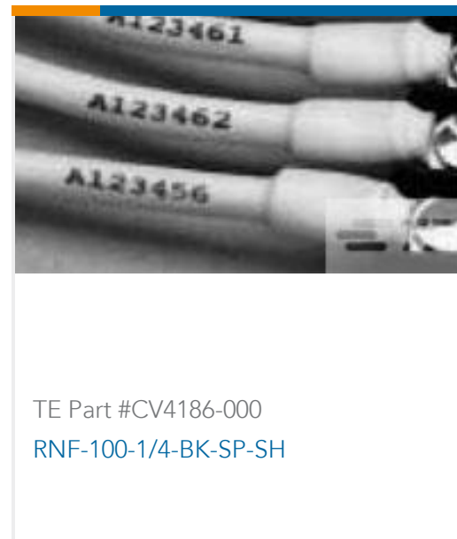
TE Part #CV4186-000 RNF-100-1/4-BK-SP-SH