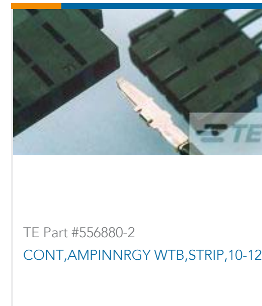
TE Part #556880-2 CONT, AMPINRGY WTB, STRIP, 10-12