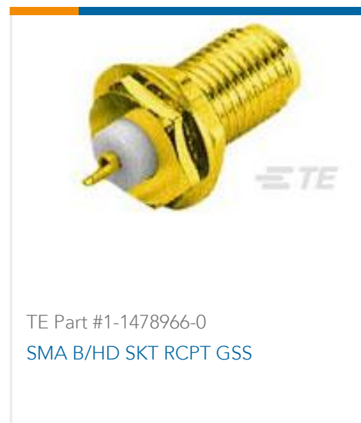
TE Part #1-1478966-0 SMA B/HD SKT RCPT GSS