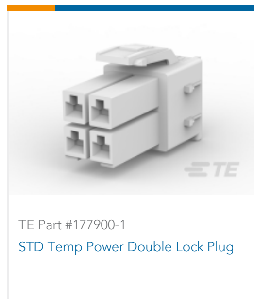
TE Part #177900-1 STD Temp Power Double Lock Plug