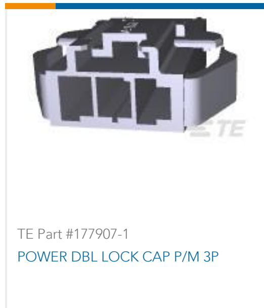
TE Part #177907-1 POWER DBL LOCK CAP P/M 3P