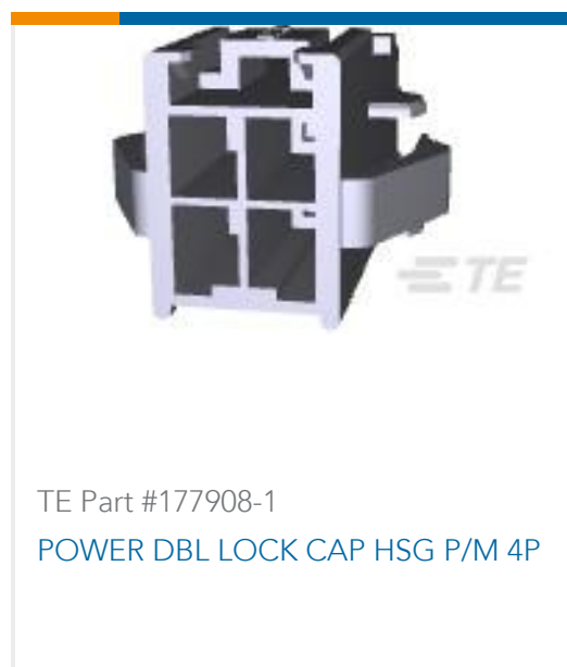
TE Part #177908-1 POWER DBL LOCK CAP HSG P/M 4P