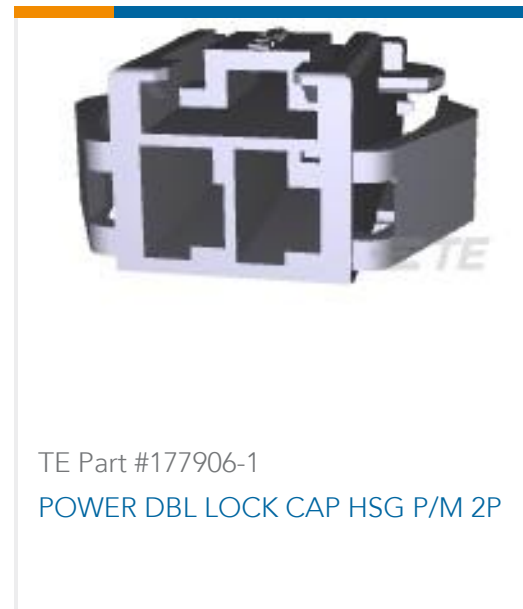
TE Part #177906-1 POWER DBL LOCK CAP HSG P/M 2P