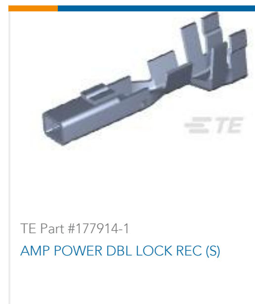
TE Part #177914-1 AMP POWER DBL LOCK REC (S)