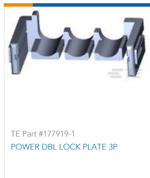
TE Part #177919-1 POWER DBL LOCK PLATE 3P