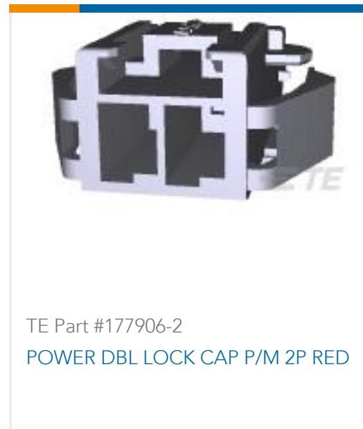
TE Part #177906-2 POWER DBL LOCK CAP P/M 2P RED