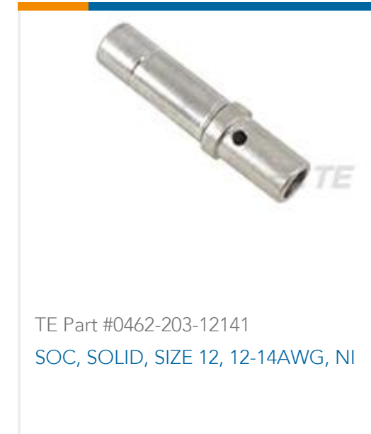
TE Part #0462-203-12141 SOC, SOLID, SIZE 12, 12-14AWG, NI