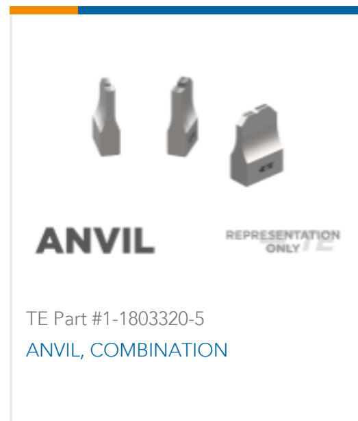
TE Part #1-1803320-5 ANVIL, COMBINATION