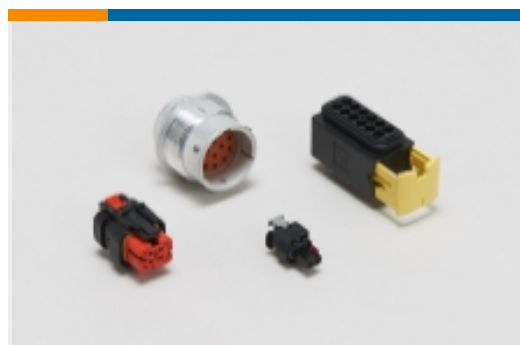
Automotive Housings (34)