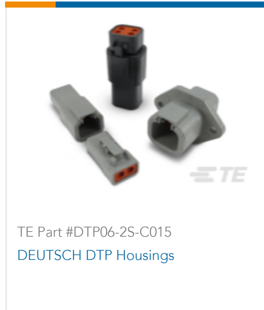
TE Part #DTP06-2S-C015 DEUTSCH DTP Housings