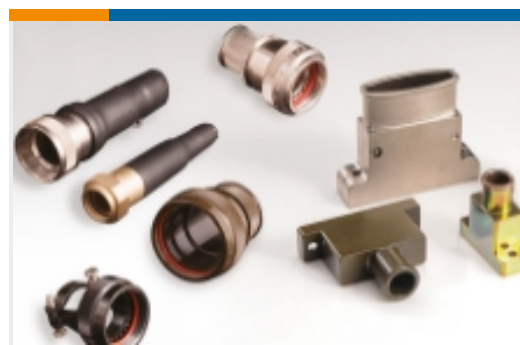
Connector Backshells (1)