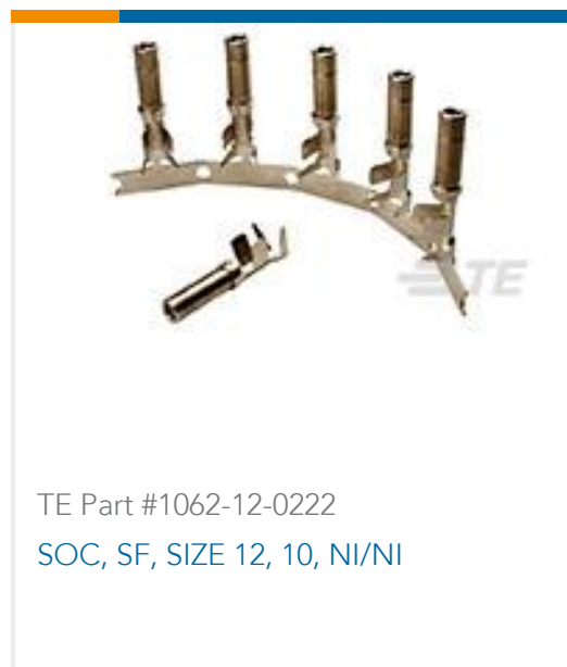
TE Part #1062-12-0222 SOC, SF, SIZE 12, 10, NI/NI