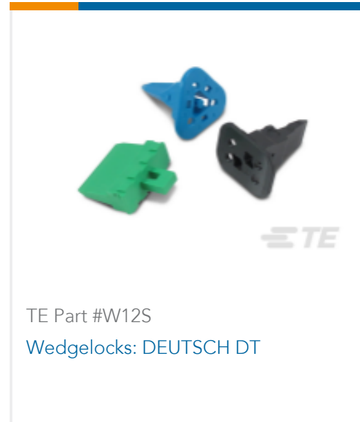
TE Part #W12S Wedgelocks: DEUTSCH DT