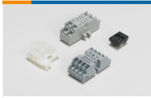
Relay Accessories, Sockets & Clips(12)