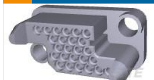
TE Part #211150-1 METRIMATE SKT HSG 25P