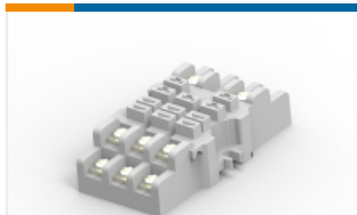
TE Part #1393143-5 27E121=SOCKET,KUP,11,SCW,PLE