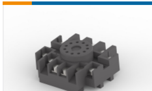
TE Part #2-1419106-4 27E892=SOCKET,KRPA,11,OCTAL,PO