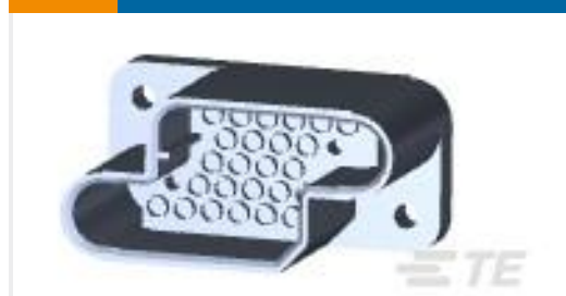
TE Part #211149-1 PIN HSG,25 POSN,METRIMATE