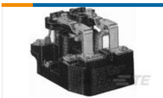
TE Part #2-1393127-6 PRD-11AY0-120=PRD