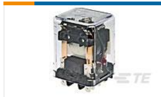
TE Part #4-2027183-3 KUEP-11D15-125=RELAY,3A,2C, AGCDO,QC.187,