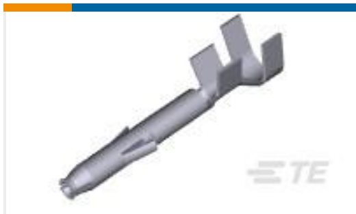
TE Part #794407-1 MINI UNML SCKT 20-16 AWG SN