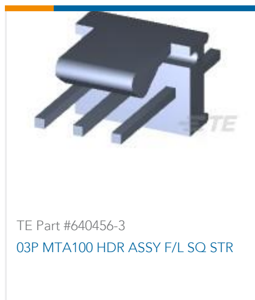
TE Part #640456-3 03P MTA100 HDR ASSY F/L SQ STR