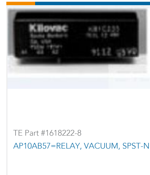
TE Part #1618222-8 AP10AB57=RELAY, VACUUM, SPST-N Screw #6