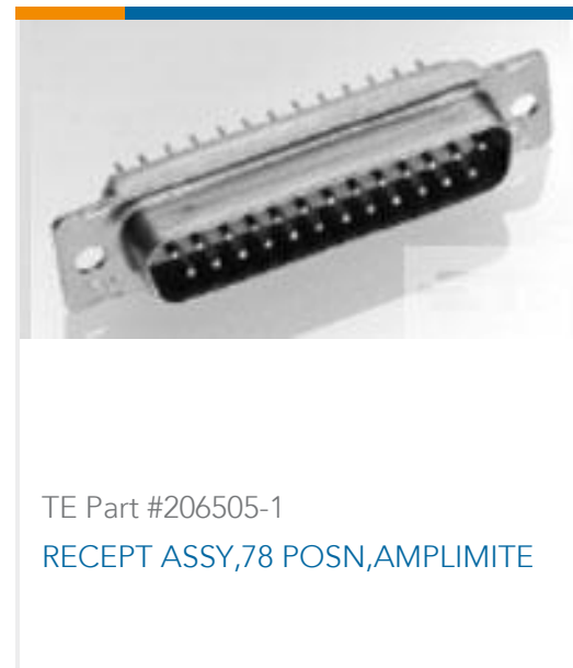
TE Part #206505-1 RECEPT ASSY,78 POSN,AMPLIMITE