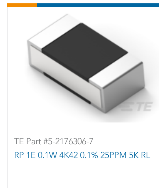
TE Part #5-2176306-7 RP 1E 0.1W 4K42 0.1% 25PPM 5K RL OFF