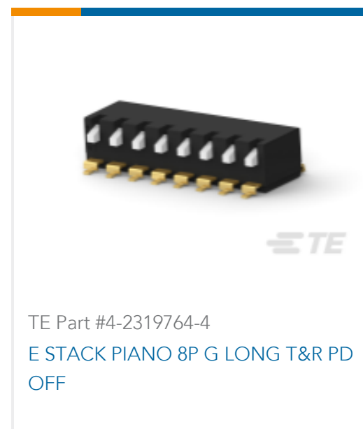
TE Part #4-2319764-4 E STACK PIANO 8P G LONG T&R PD OFF