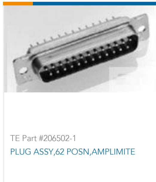
TE Part #206502-1 PLUG ASSY,62 POSN,AMPLIMITE