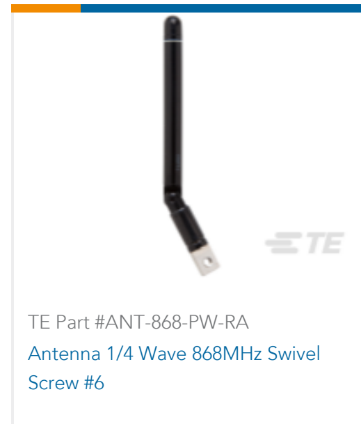
TE Part #ANT-868-PW-RA Antenna 1/4 Wave 868MHz Swivel Screw #6