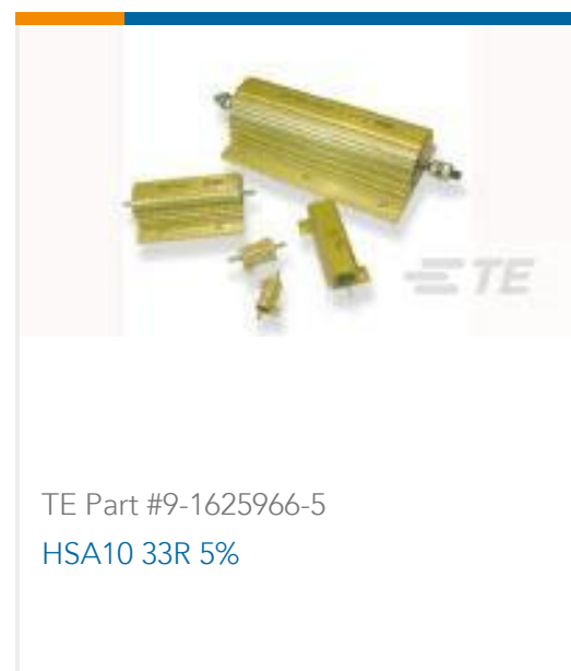
TE Part #9-1625966-5 HSA10 33R 5%