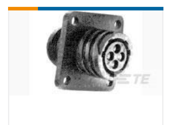
TE Part #206430-1 RECPT, SZ 11-4, CPC