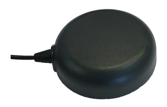
TW7872 Dimensions (mm)

This product is also available in an OEM format (TW3867 for 28dB and TW3872E for 35dB)