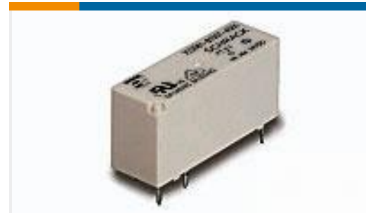
TE Part #2-1393222-0 V23061A1005A302=MINISTARKSTROM