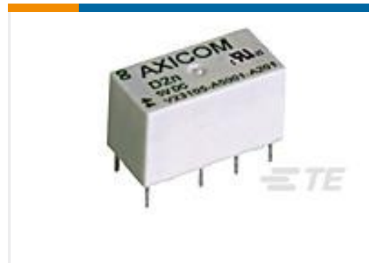
TE Part #1393793-8 V23105A5403A201