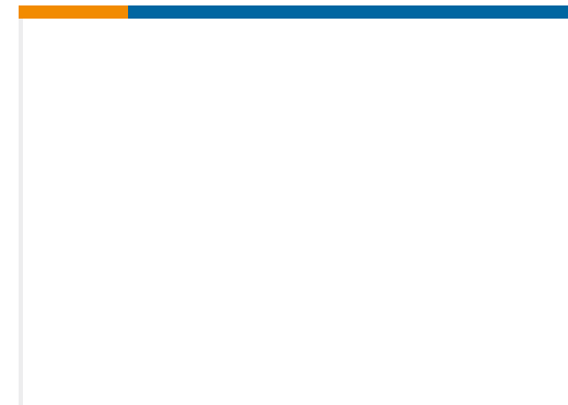
TE Part #1SNA103332R2400 FEF 12-1