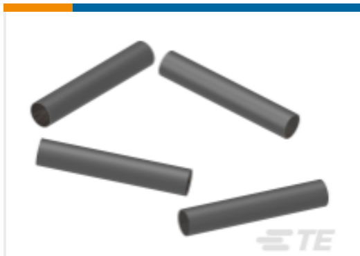
TE Part #NB25842001 SCL-3/8-0-STK