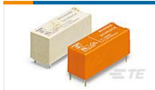
TE Part #1-1393225-9 RY611012