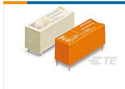
TE Part #8-1393224-8 RY533012