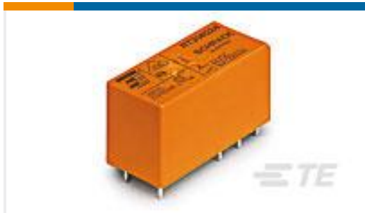
TE Part #1393243-4 RTE24012