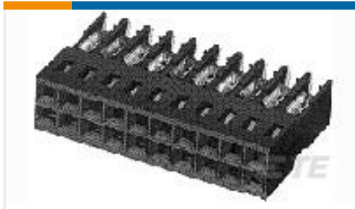
TE Part #5-102448-4 12 AMPMODU MT ASSY DR.100CL SN