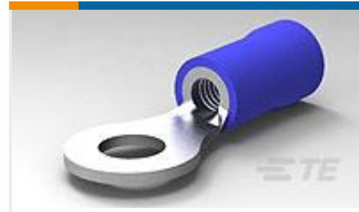
TE Part #34160 TERMINAL, PG R 16-14 8