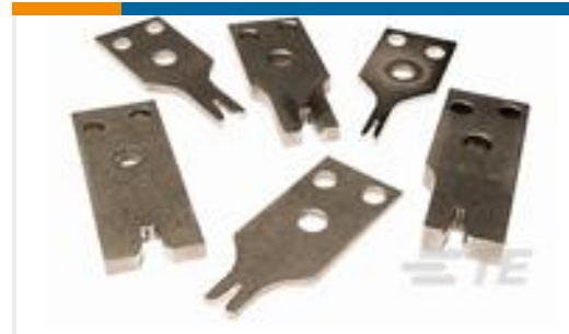
TE Part #7-1633305-2 CRIMPER, WIRE PREMIUM (.055" 'F')