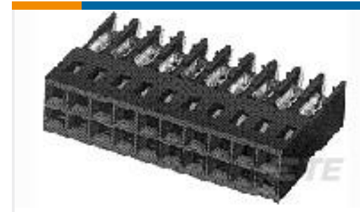
TE Part #6-102448-0 24 AMPMODU MT ASSY DR.100CL SN