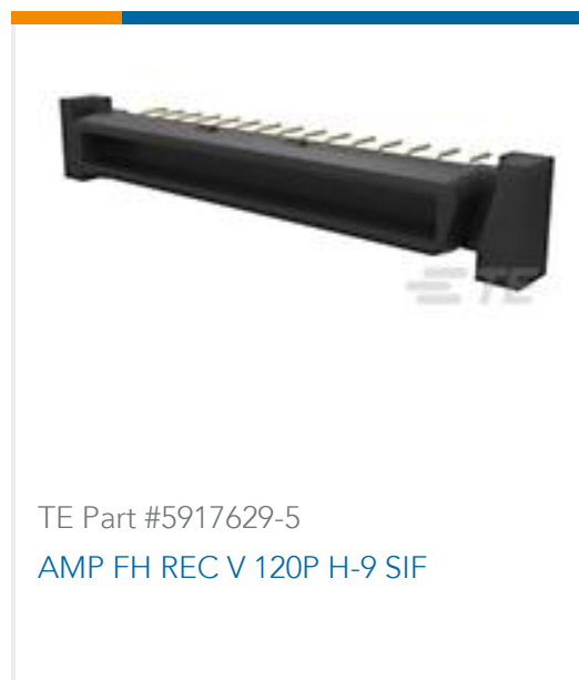
TE Part #5917629-5 AMP FH REC V 120P H-9 SIF