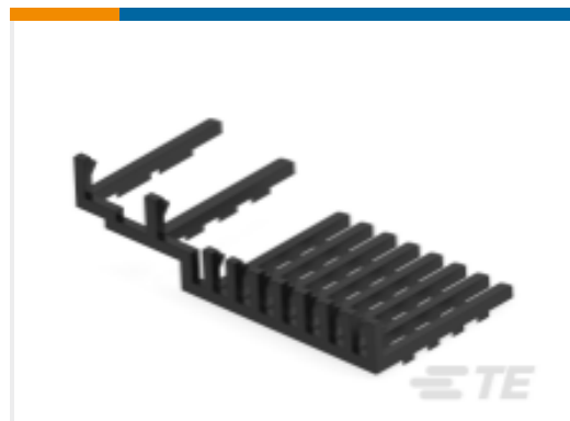
TE Part #965663-1 KONTAKTSICHERUNG