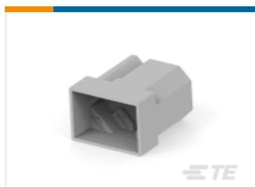
TE Part #K1007168 Steckhuelsengeh. 08-2-2-05 08-80-125