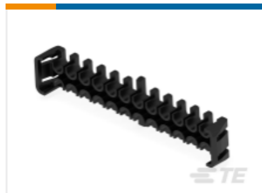
TE Part #964740-1 KONTAKTSICHERUNG24P