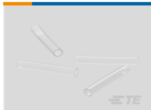
TE Part #8953156005 RPPM Heat Shrink Tubing