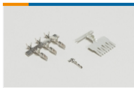
Busbars & Terminals(1)