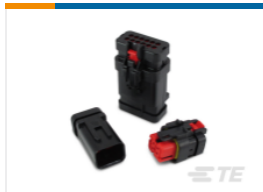
TE Part #776533-4 AMPSEAL 16 Housings