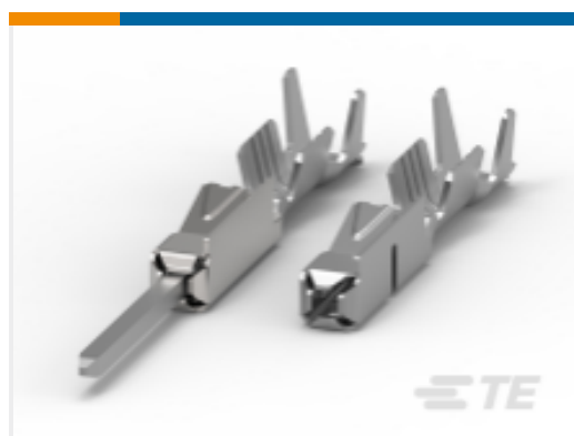
TE Part #968074-2 MOS, RECEPTACLE AND TAB