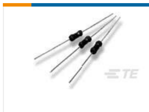
TE Part #5-1879354-9 RR03 5% 82R AMMO