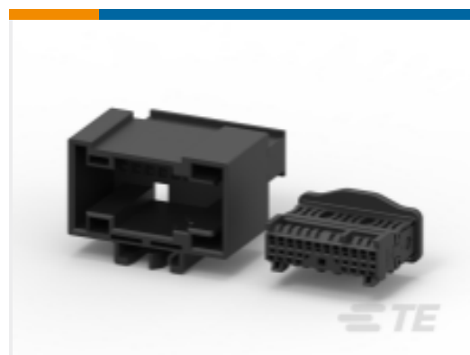
TE Part #2141404-1 MOS, CONNECTOR HOUSING