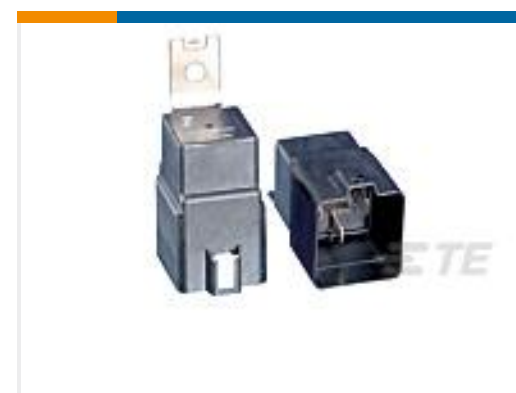
TE Part #1-1414121-0 V23136B1001X051-EV-CBOX