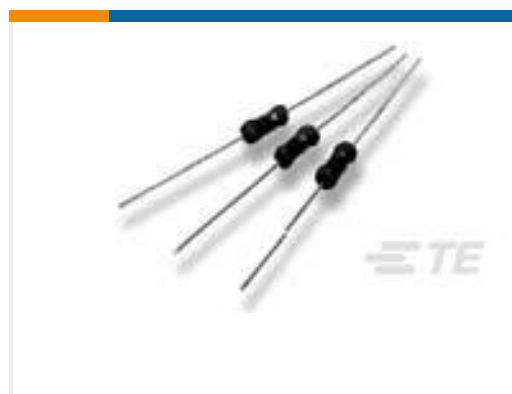
TE Part #3-1879354-7 RR03 5% 10R AMMO