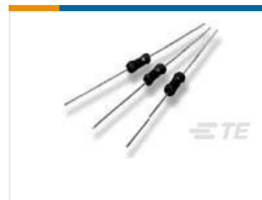
TE Part #4-1879354-2 RR03 5% 16R AMMO