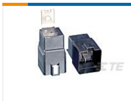
TE Part #1-1414552-0 V23136A1001X057-EV-CBOX