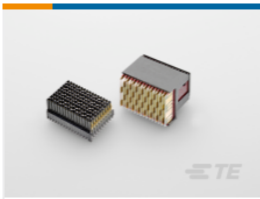
TE Part #2302785-1 RA PLUG ASSY,7ROW,CENTER,VPX, MG RT3