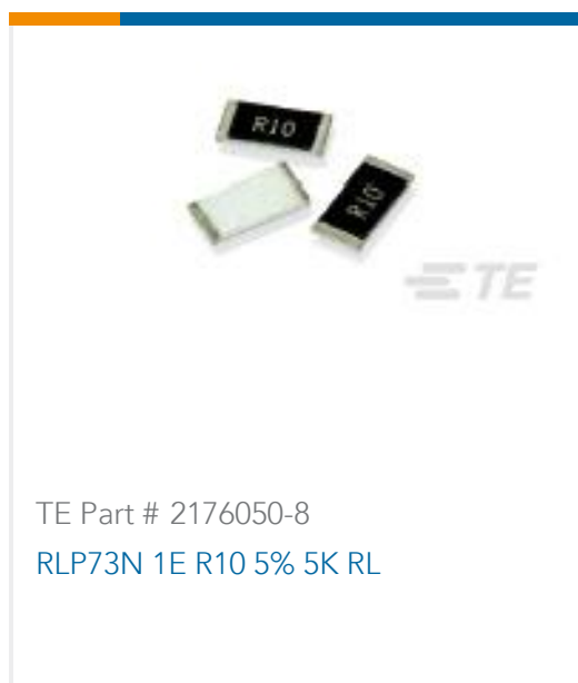
TE Part # 2176050-8 RLP73N 1E R10 5% 5K RL