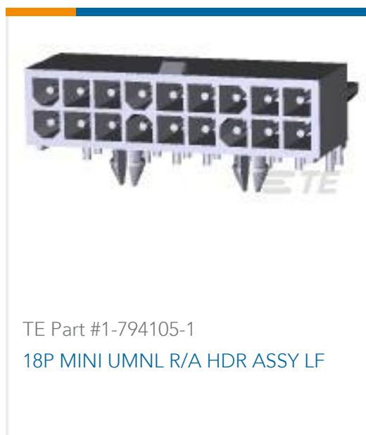
TE Part #1-794105-1 18P MINI UMN L R/A HDR ASSY LF