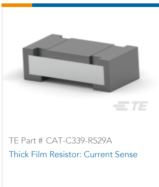
TE Part # CAT-C339-R529A Thick Film Resistor: Current Sense