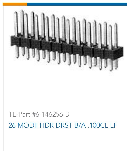
TE Part #6-146256-3 26 MODII HDR DRST B/A .100CL LF