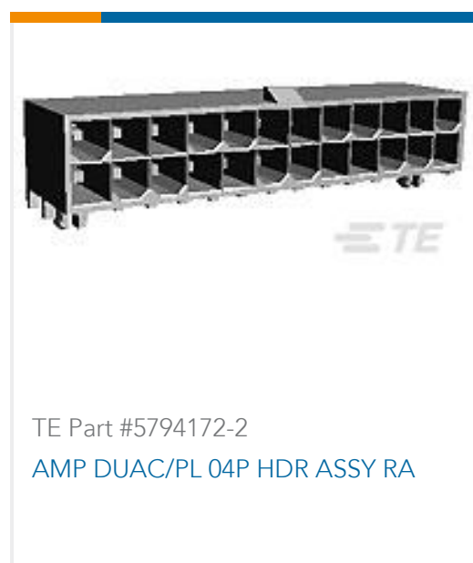
TE Part #5794172-2 AMP DUAC/PL 04P HDR ASSY RA