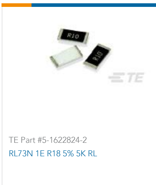
TE Part #5-1622824-2 RL73N 1E R18 5% 5K RL