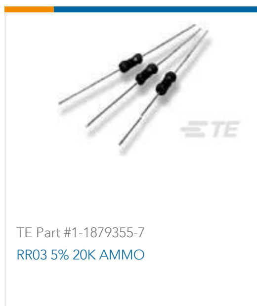
TE Part #1-1879355-7 RR03 5% 20K AMMO