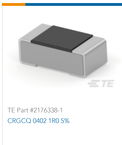
TE Part #2176338-1 CRGCQ 0402 1R0 5%