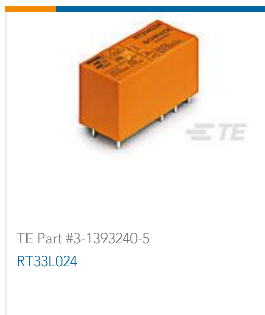
TE Part #3-1393240-5 RT33L024