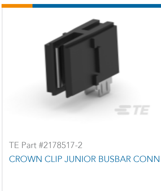
TE Part #2178517-2 CROWN CLIP JUNIOR BUSBAR CONN