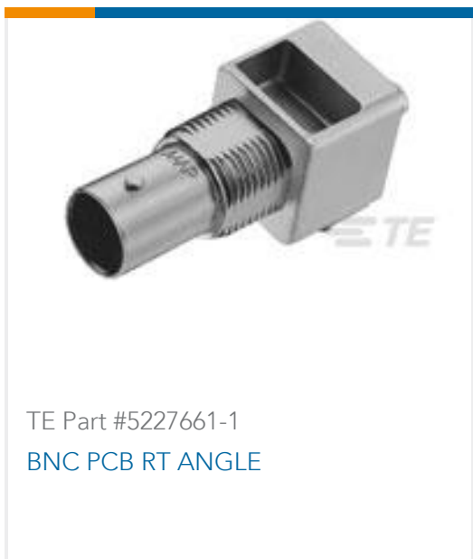
TE Part #5227661-1 BNC PCB RT ANGLE