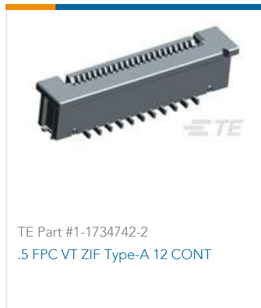
TE Part #1-1734742-2 .5 FPC VT ZIF Type-A 12 CONT