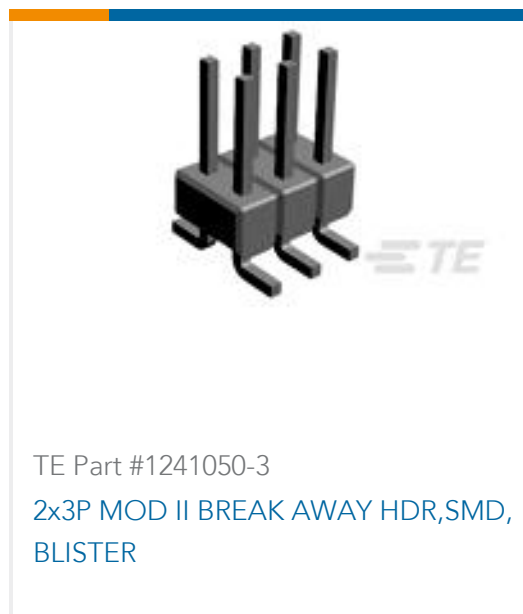
TE Part #1241050-3 2x3P MOD II BREAK AWAY HDR,SMD, BLISTER