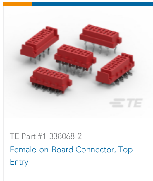
TE Part #1-338068-2 Female-on-Board Connector, Top Entry