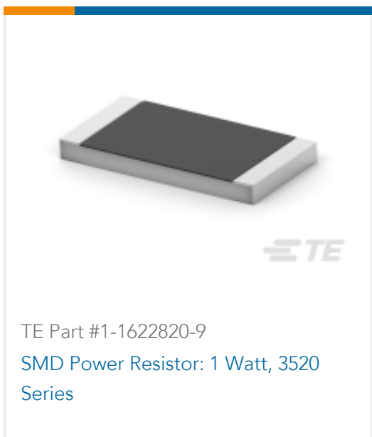
TE Part #1-1622820-9 SMD Power Resistor: 1 Watt, 3520 Series