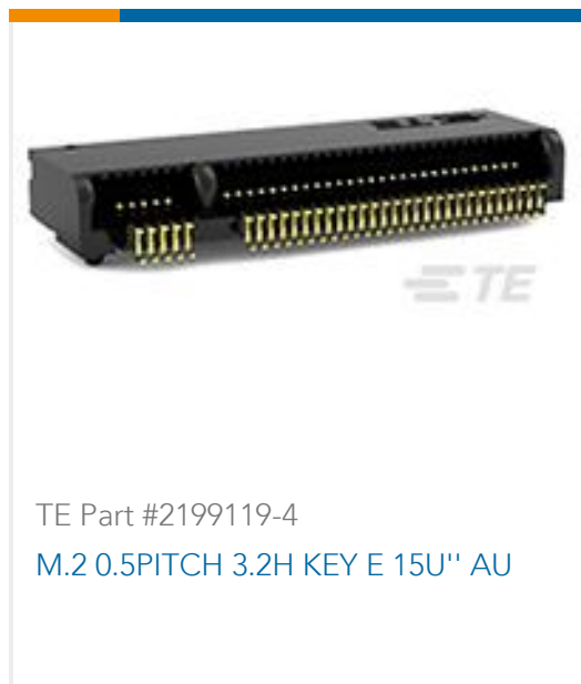
TE Part #2199119-4 M.2 0.5PITCH 3.2H KEY E 15U" AU