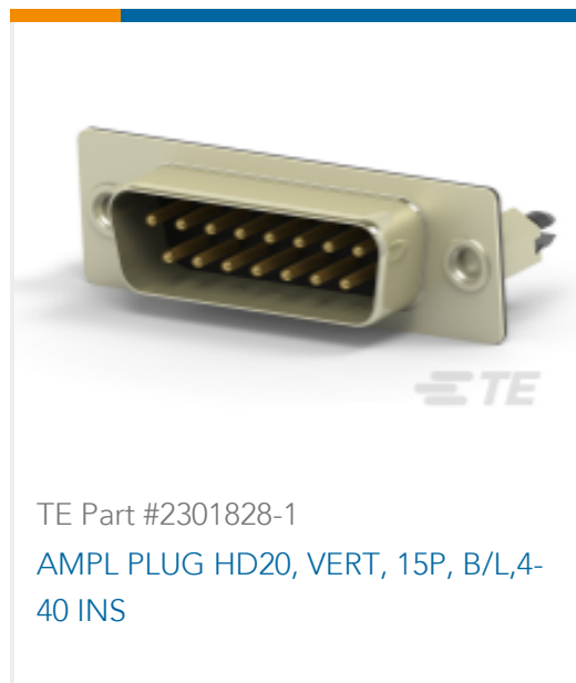
TE Part #2301828-1 AMPL PLUG HD20, VERT, 15P, B/L,4-40 INS