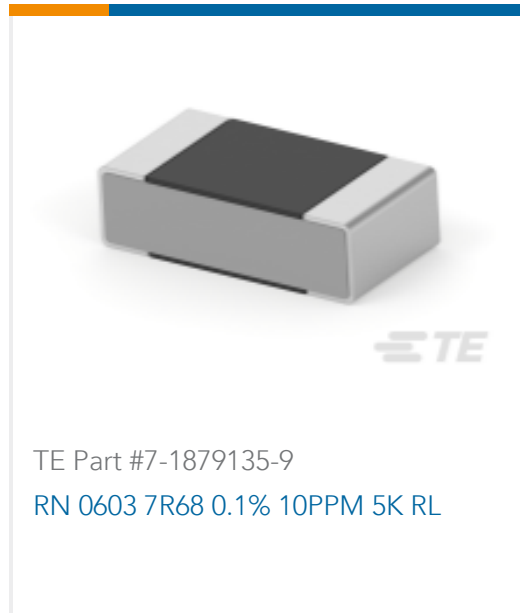
TE Part #7-1879135-9 RN 0603 7R68 0.1% 10PPM 5K RL