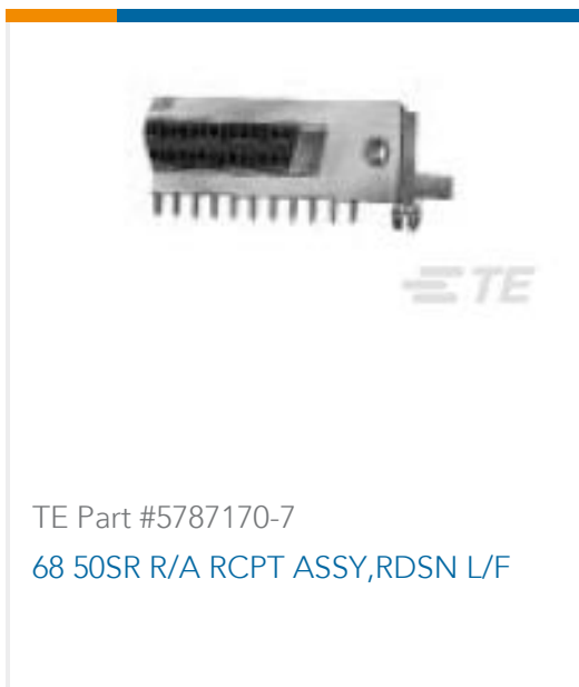
TE Part #5787170-7 68 50SR R/A RCPT ASSY,RDSN L/F