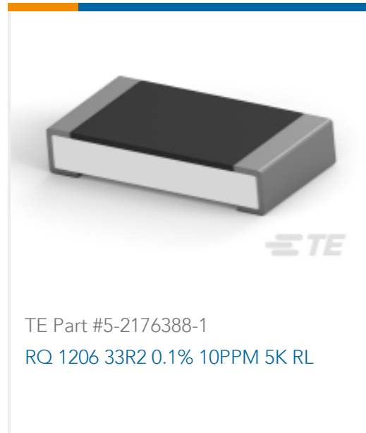
TE Part #5-2176388-1 RQ 1206 33R2 0.1% 10PPM 5K RL