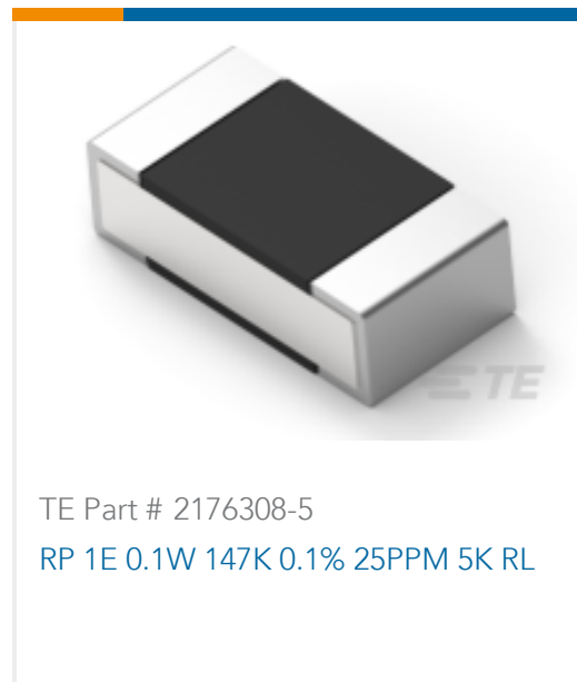
TE Part # 2176308-5 RP 1E 0.1W 147K 0.1% 25PPM 5K RL