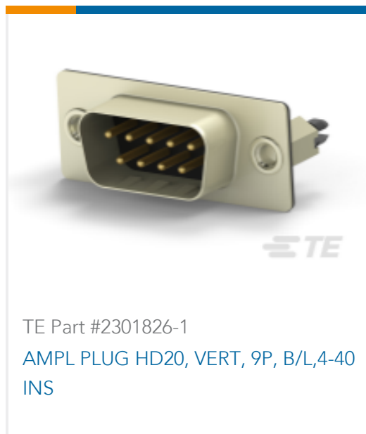
TE Part #2301826-1 AMPL PLUG HD20, VERT, 9P, B/L,4-40 INS