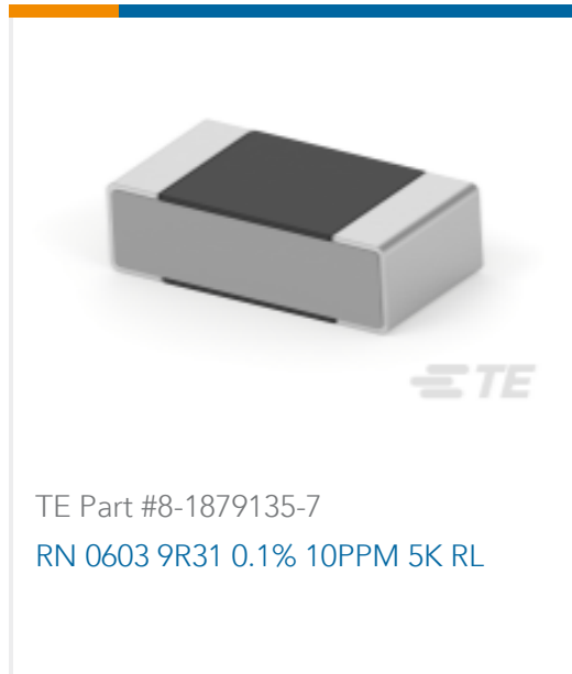
TE Part #8-1879135-7 RN 0603 9R31 0.1% 10PPM 5K RL