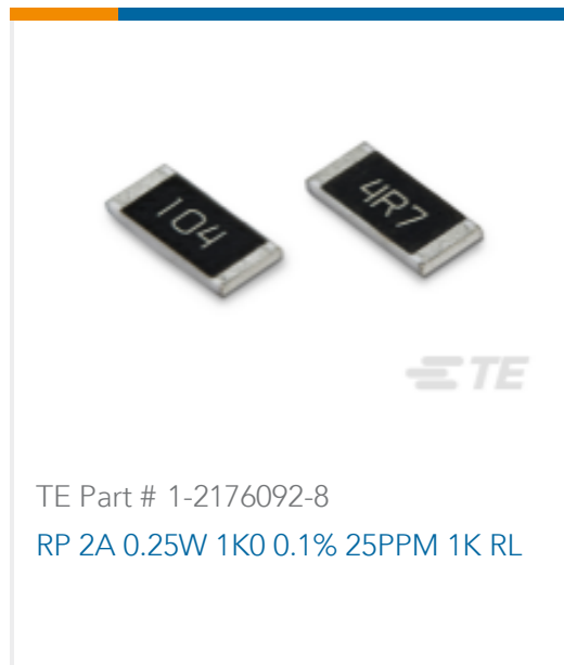
TE Part # 1-2176092-8 RP 2A 0.25W 1K0 0.1% 25PPM 1K RL