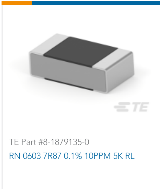
TE Part #8-1879135-0 RN 0603 7R87 0.1% 10PPM 5K RL