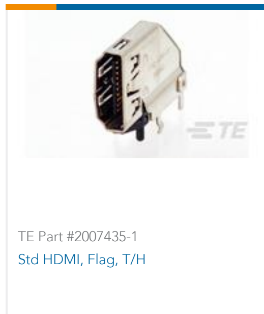
TE Part #2007435-1 Std HDMI, Flag, T/H