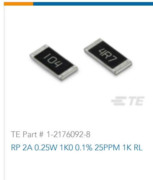
TE Part # 1-2176092-8 RP 2A 0.25W 1K0 0.1% 25PPM 1K RL