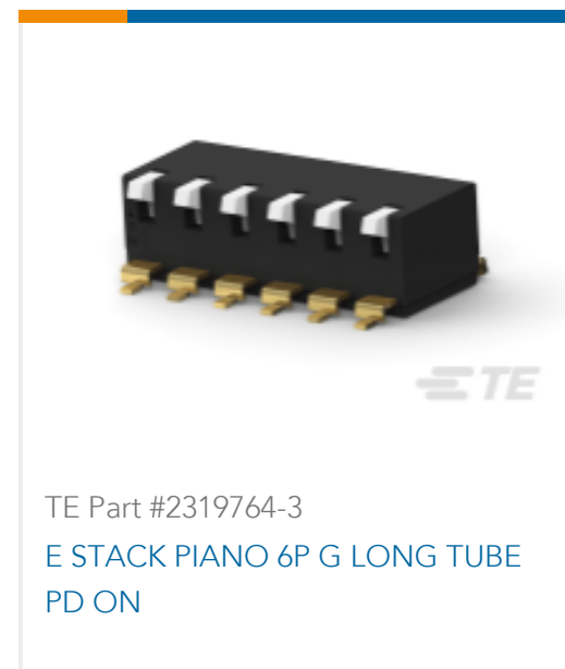
TE Part #2319764-3 E STACK PIANO 6P G LONG TUBE PD ON