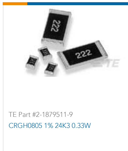
TE Part #2-1879511-9 CRGH0805 1% 24K3 0.33W