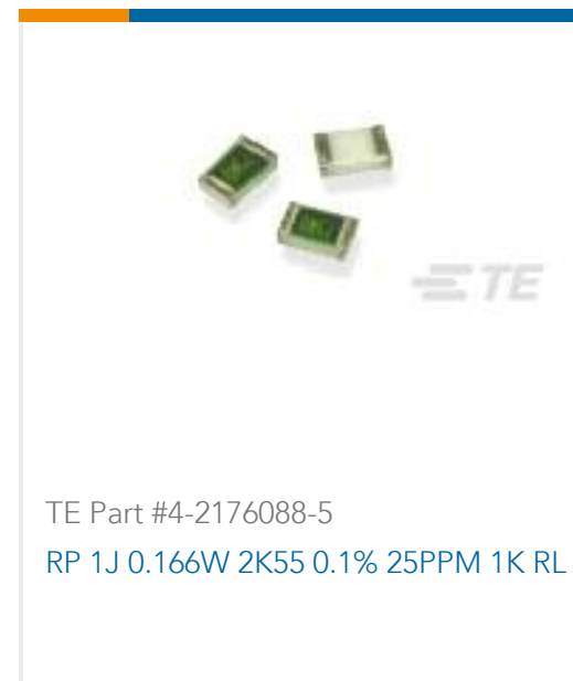
TE Part #4-2176088-5 RP 1J 0.166W 2K55 0.1% 25PPM 1K RL