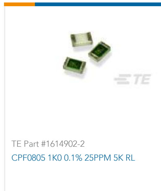
TE Part #1614902-2 CPF0805 1K0 0.1% 25PPM 5K RL