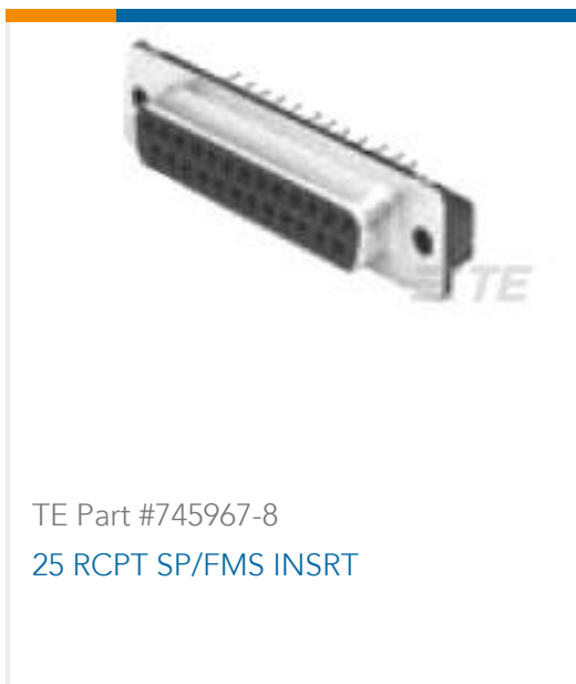
TE Part #745967-8 25 RCPT SP/FMS INSRT