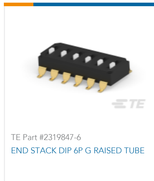
TE Part #2319847-6 END STACK DIP 6P G RAISED TUBE