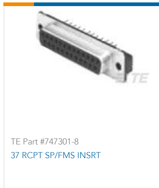
TE Part #747301-8 37 RCPT SP/FMS INSRT