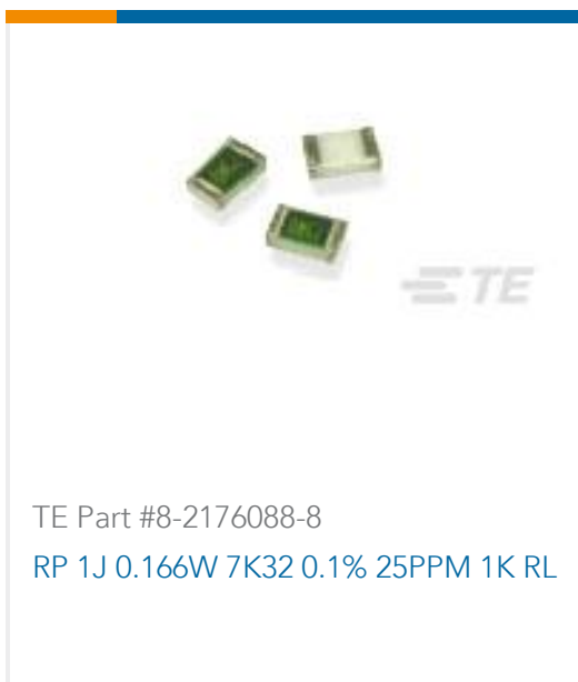
TE Part #8-2176088-8 RP 1J 0.166W 7K32 0.1% 25PPM 1K RL