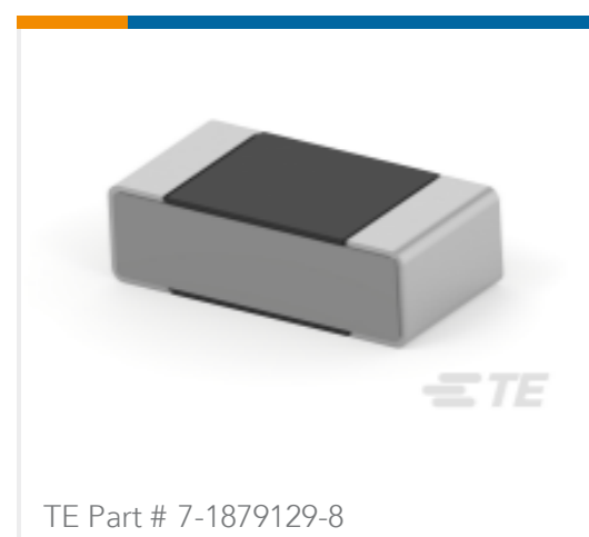
RN 0402 2K21 0.1% 10PPM 5K RL