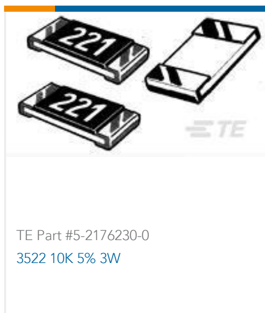
TE Part #5-2176230-0 3522 10K 5% 3W