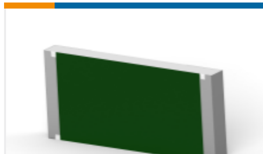
TE Part #9-2176404-8 3550 180R 5%