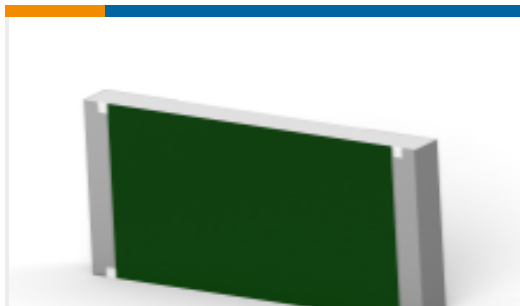
TE Part #9-2176404-7 3550 150R 5%