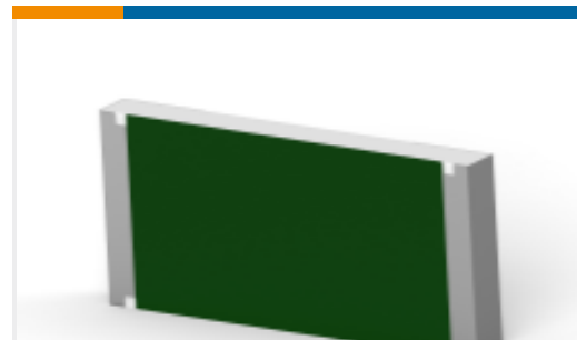
TE Part #3-2176403-3 3550 22R 1%