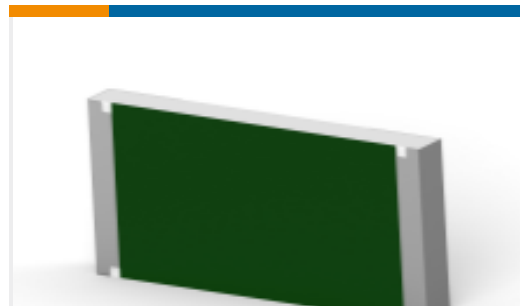
TE Part #5-2176403-6 3550 200R 1%