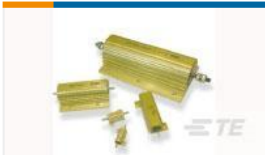
TE Part #3-1630186-6 HSA50 14R 5%