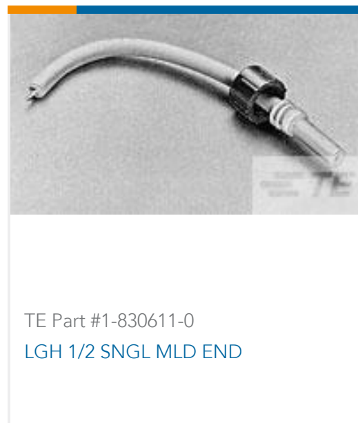
TE Part #1-830611-0 LGH 1/2 SNGL MLD END