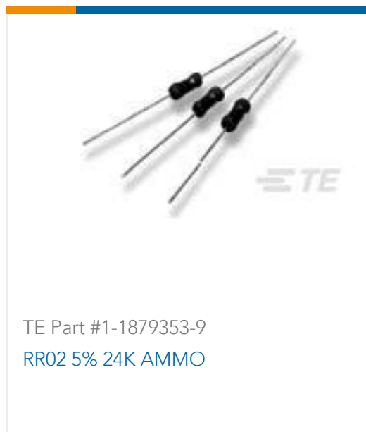
TE Part #1-1879353-9 RR02 5% 24K AMMO