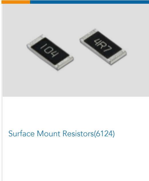
Surface Mount Resistors(6124)