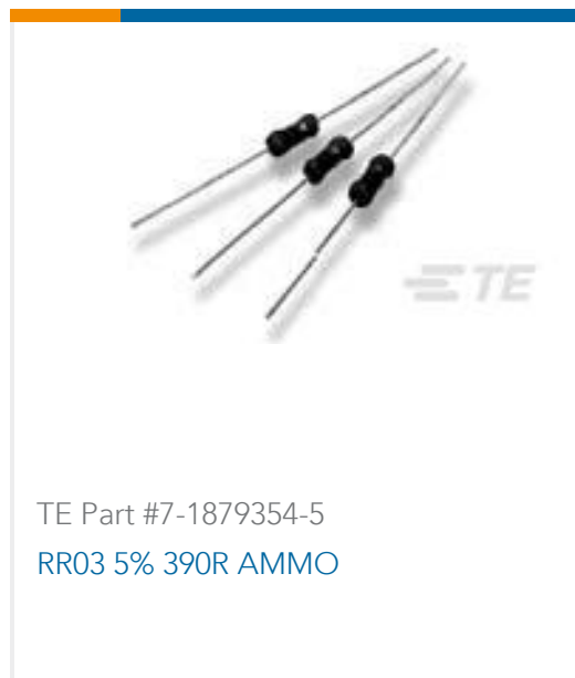
TE Part #7-1879354-5 RR03 5% 390R AMMO