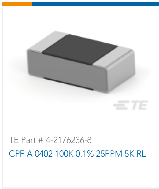
TE Part # 4-2176236-8 CPF A 0402 100K 0.1% 25PPM 5K RL