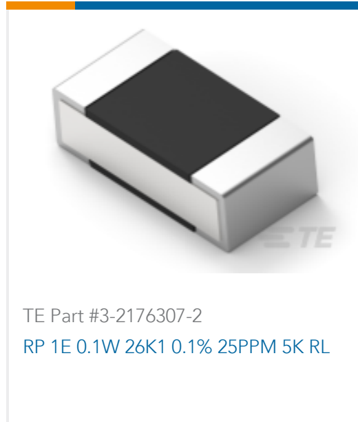
TE Part #3-2176307-2 RP 1E 0.1W 26K1 0.1% 25PPM 5K RL