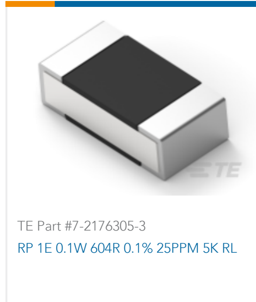
TE Part #7-2176305-3 RP 1E 0.1W 604R 0.1% 25PPM 5K RL