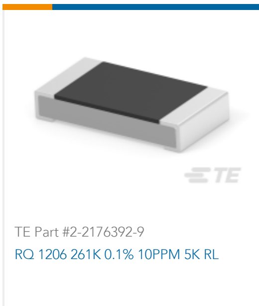
TE Part #2-2176392-9 RQ 1206 261K 0.1% 10PPM 5K RL