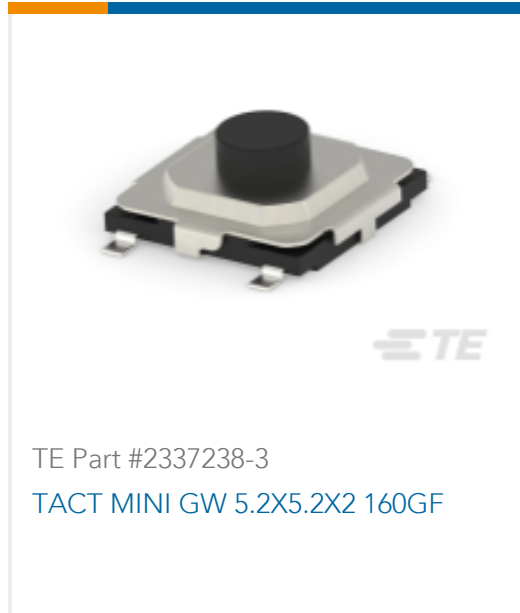
TE Part #2337238-3 TACT MINI GW 5.2X5.2X2 160GF