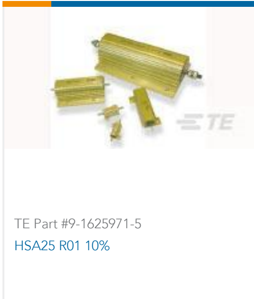
TE Part #9-1625971-5 HSA25 R01 10%