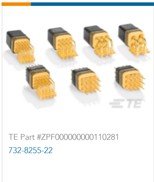
TE Part #ZPF00000000110281 732-8255-22