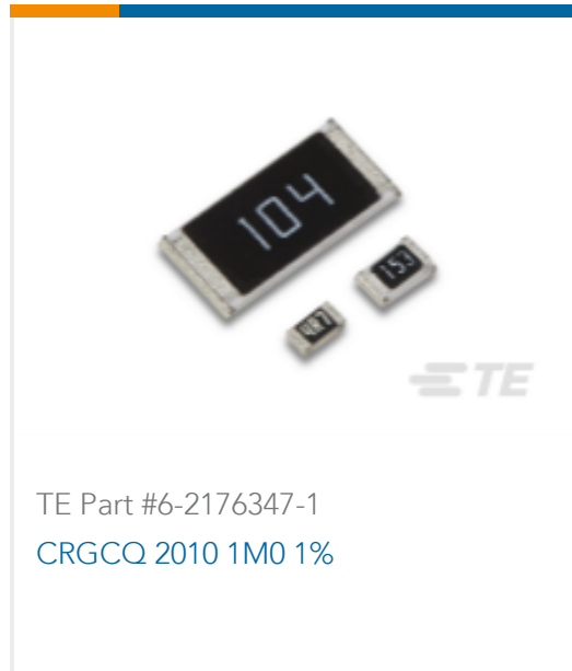
TE Part #6-2176347-1 CRGCQ 2010 1M0 1%