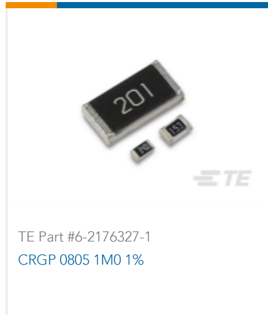
TE Part #6-2176327-1 CRGP 0805 1M0 1%