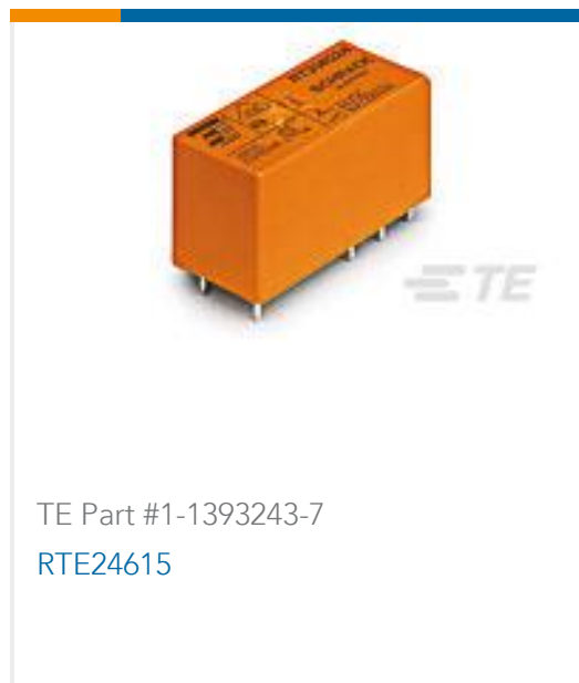
TE Part #1-1393243-7 RTE24615