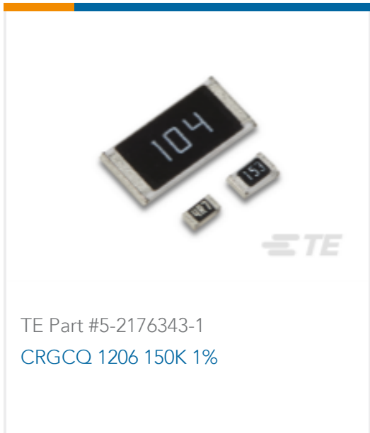
TE Part #5-2176343-1 CRGCQ 1206 150K 1%