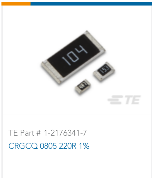
TE Part # 1-2176341-7 CRGCQ 0805 220R 1%