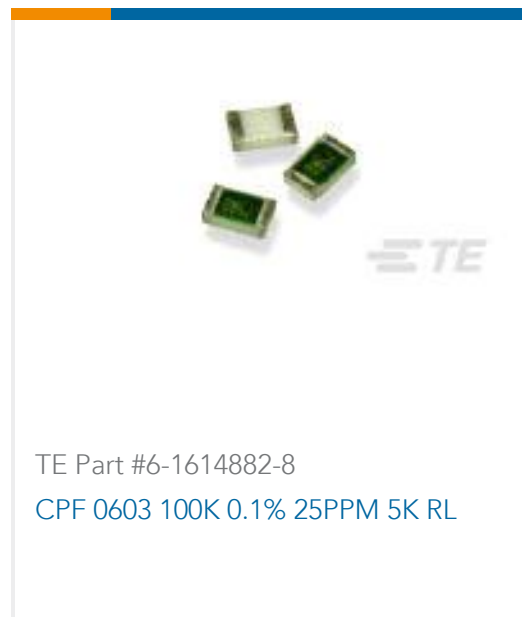
TE Part #6-1614882-8 CPF 0603 100K 0.1% 25PPM 5K RL