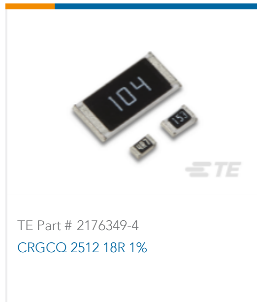
TE Part # 2176349-4 CRGCQ 2512 18R 1%