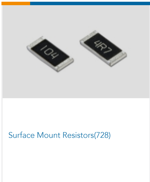
Surface Mount Resistors(728)