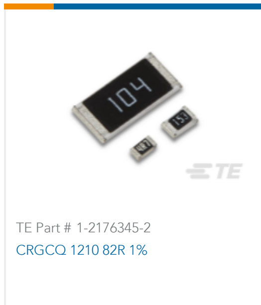
TE Part # 1-2176345-2 CRGCQ 1210 82R 1%