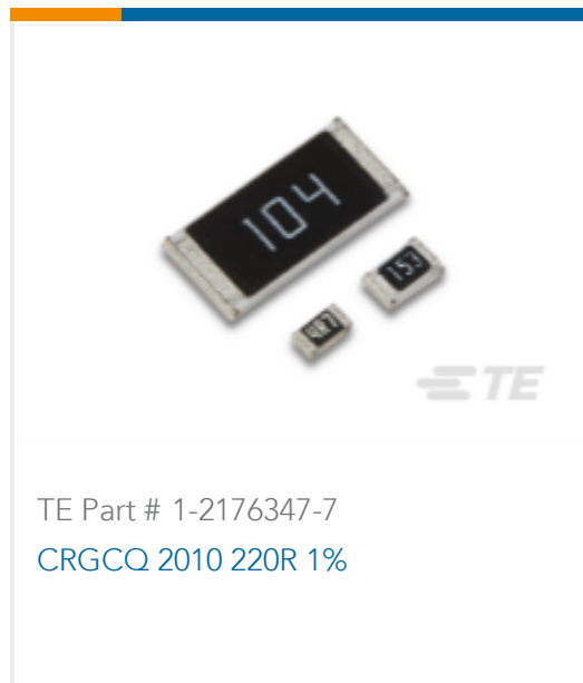
TE Part # 1-2176347-7 CRGCQ 2010 220R 1%