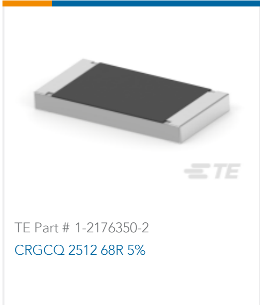
TE Part # 1-2176350-2 CRGCQ 2512 68R 5%