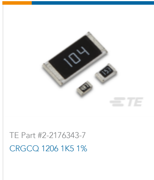
TE Part #2-2176343-7 CRGCQ 1206 1K5 1%