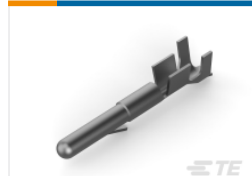
TE Part #917636-1 MATE-N-LOK PIN CONT H-PRESSURE