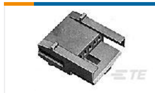
TE Part #172211-2 EIS CAP HSG FREE HANG 2P NATUTURAL