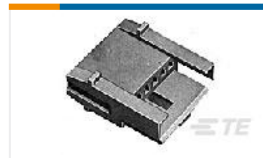
TE Part #1-172211-0 10P CAP HSG F/H EI S CONN.