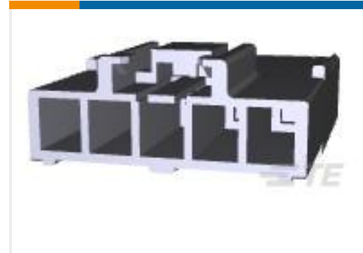
TE Part #178479-1 AMP UP CAP HSG F/H 5P NATURAL