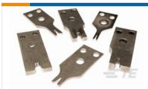
TE Part #1-937188-2 CRIMPER,WIRE