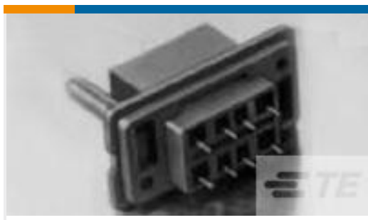
TE Part #5172625-3 DRAWER CONN. FEMALE ASSY 24P