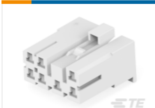
TE Part #172025-1 MIC PLUG HSG 7 POS