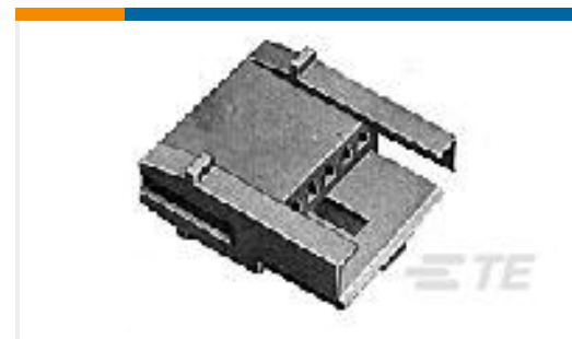
TE Part #172211-6 EIS CAP HSG FREE HANG 6P NATUTURAL