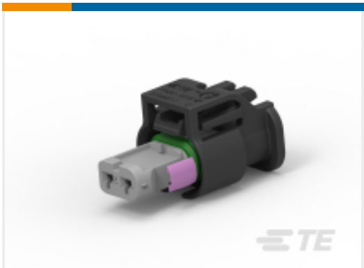
TE Part #2-2236896-1 2POS, MCON 1.2 LL REC SEALED