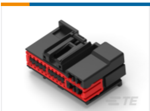
TE Part #2236269-1 24POS, MIXED,REC HSG, 20GENYMCP,ASSY,CODA