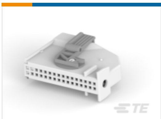
TE Part #2-967348-2 MQS SHIELD FOR HOUSING 32POS.