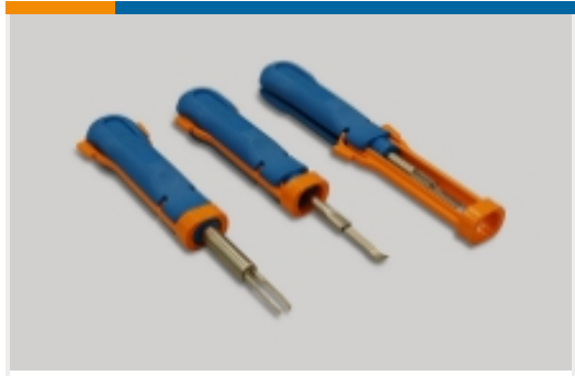
Insertion & Extraction Tools(13)