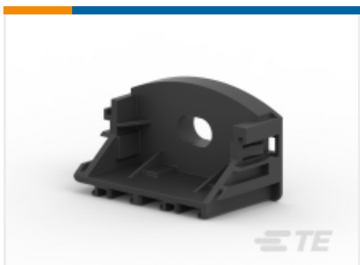
TE Part #2066561-1 MOUNTING BRACKET, ENGINE COMPT FRB