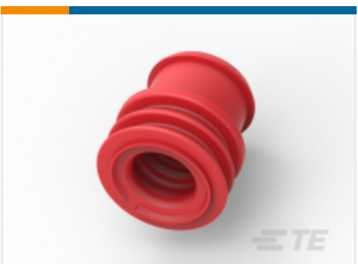
TE Part #968043-1 SINGLE WIRE SEAL