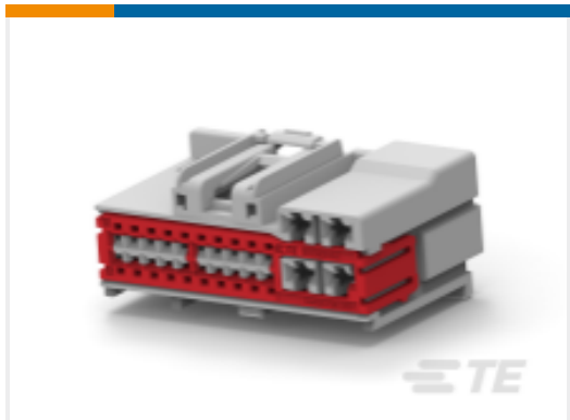
TE Part #1-2236269-2 24POS, MIXED,REC HSG, 20GENYMCP,ASSY,CODB