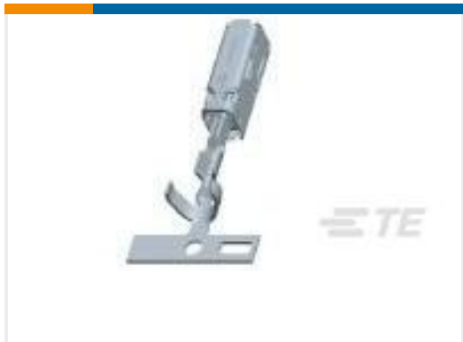
TE Part #1564984-2 AMP MCP 2.8K, CONTACT, SWS