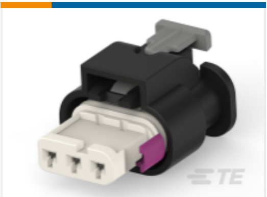
TE Part #2-2355507-1 3POS,MCON 1.2,REC HSG ASSY,SLD, COD A