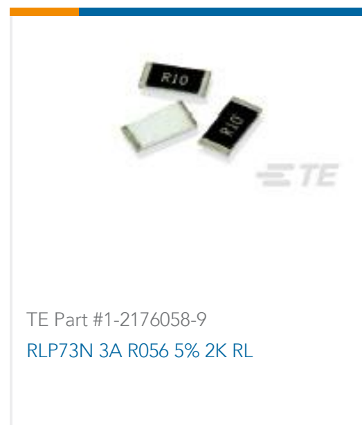
TE Part #1-2176058-9 RLP73N 3A R056 5% 2K RL