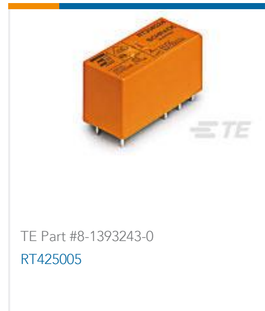
TE Part #8-1393243-0 RT425005