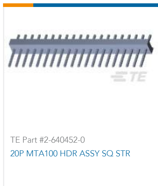
TE Part #2-640452-0 20P MTA100 HDR ASSY SQ STR