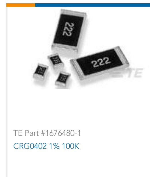
TE Part #1676480-1 CRG0402 1% 100K