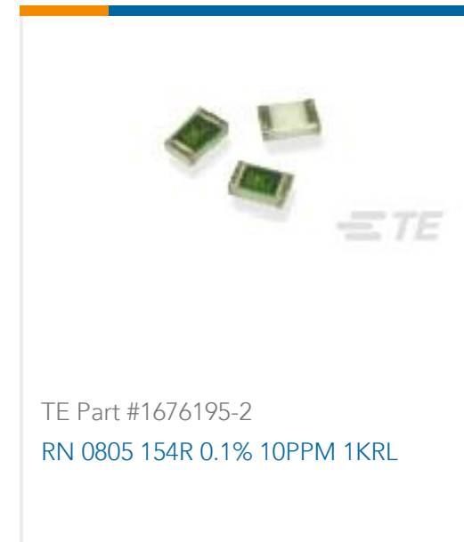
TE Part #1676195-2 RN 0805 154R 0.1% 10PPM 1KRL