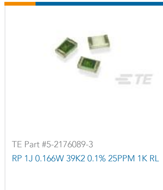
TE Part #5-2176089-3 RP 1J 0.166W 39K2 0.1% 25PPM 1K RL