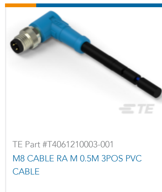
TE Part #T4061210003-001 M8 CABLE RA M 0.5M 3POS PVC CABLE