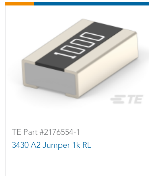
TE Part #2176554-1 3430 A2 Jumper 1k RL