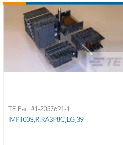
TE Part #1-2057691-1 IMP100S,R,RA3P8C,LG,39