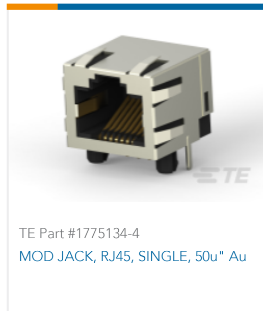
TE Part #1775134-4 MOD JACK, RJ45, SINGLE, 50u" Au