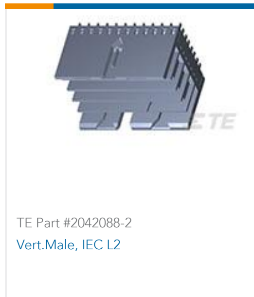
TE Part #2042088-2 Vert.Male, IEC L2