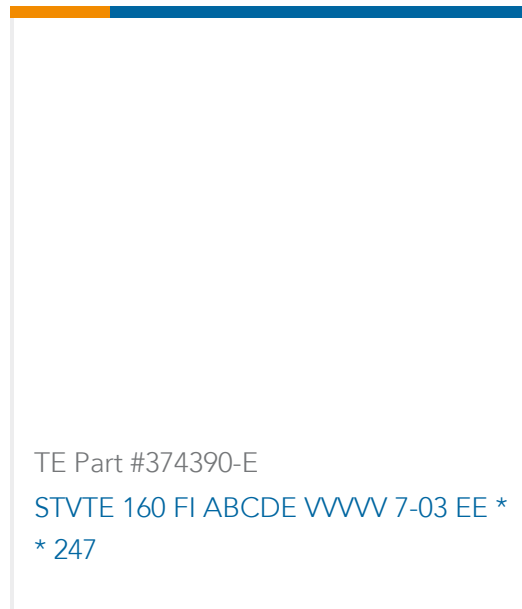
TE Part #374390-E STVTE 160 FI ABCDE VVVV 7-03 EE * * 247