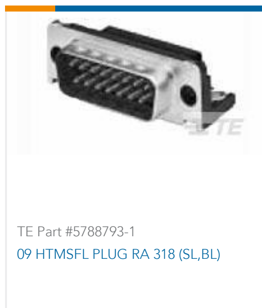
TE Part #5788793-1 09 HTMSFL PLUG RA 318 (SL,BL)