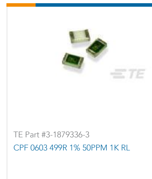
TE Part #3-1879336-3 CPF 0603 499R 1% 50PPM 1K RL