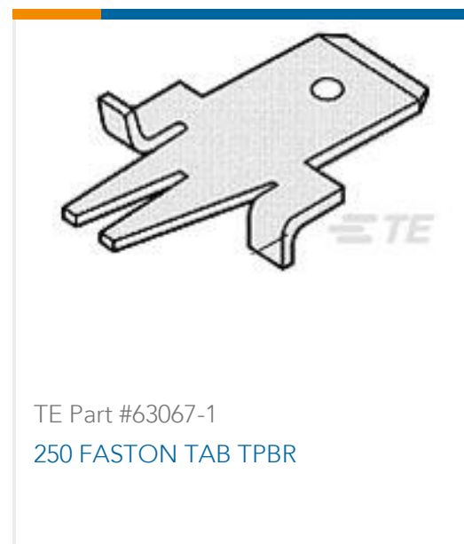
TE Part #63067-1 250 FASTON TAB TPBR