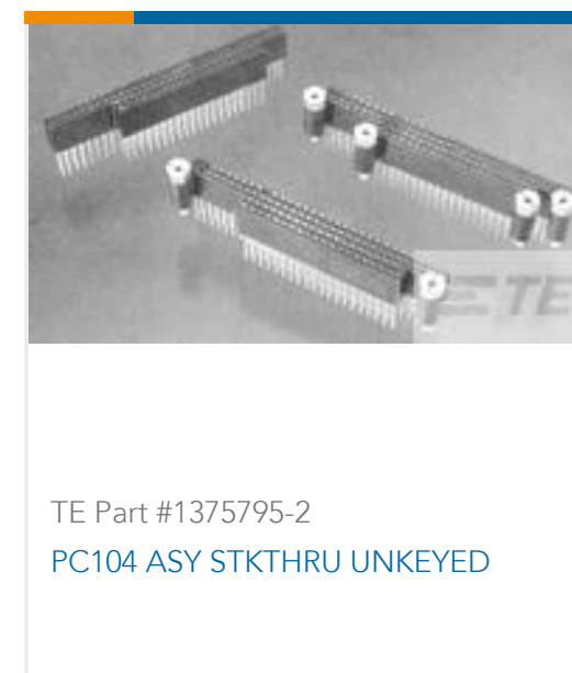
TE Part #1375795-2 PC104 ASY STKTHRU UNKEYED