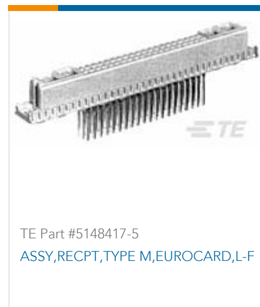
TE Part #5148417-5 ASSY,RECPT,TYPE M,EUROCARD,L-F