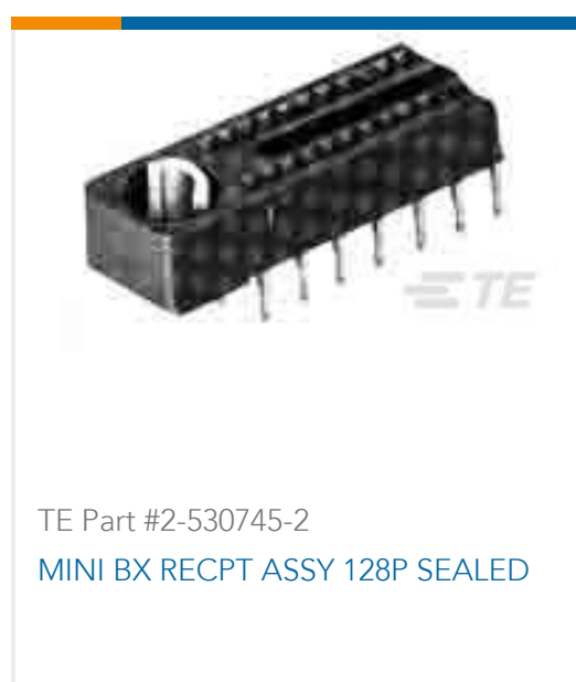
TE Part #2-530745-2 MINI BX RECPT ASSY 128P SEALED