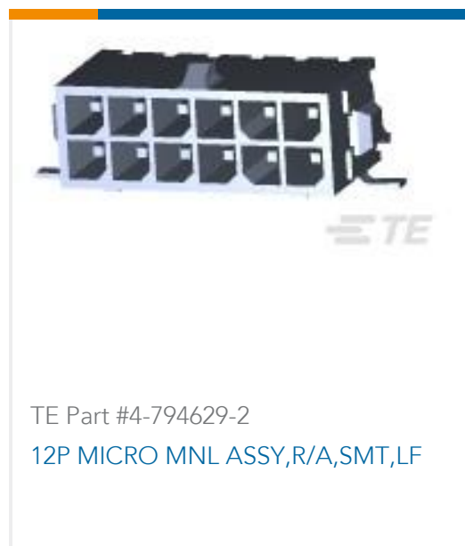
TE Part #4-794629-2 12P MICRO MNL ASSY,R/A,SMT,LF