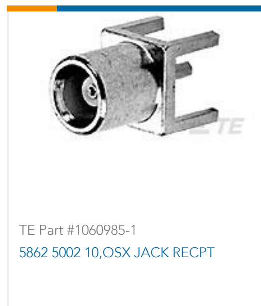
TE Part #1060985-1 5862 5002 10,OSX JACK RECPT