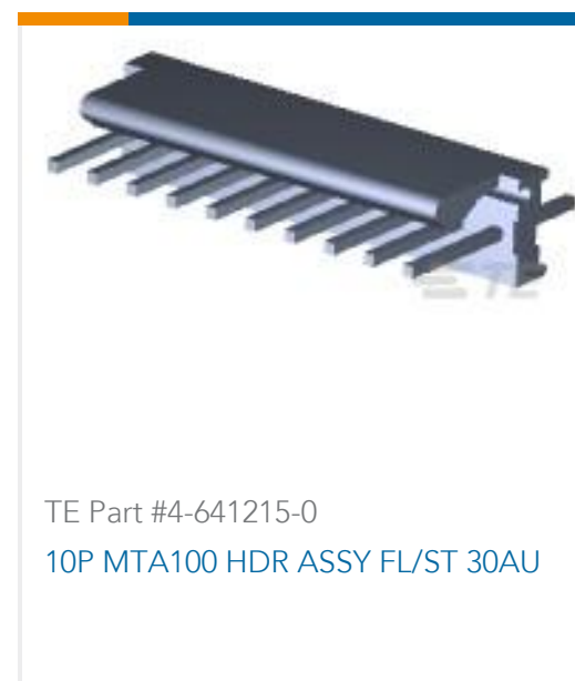
TE Part #4-641215-0 10P MTA100 HDR ASSY FL/ST 30AU