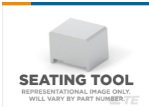
TE Part # 2018537-1 TOOL, SEAT 2 PR 16 COL,BP CONN