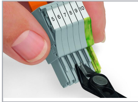
Coding a female plug: remove coding finger using a suitable tool.