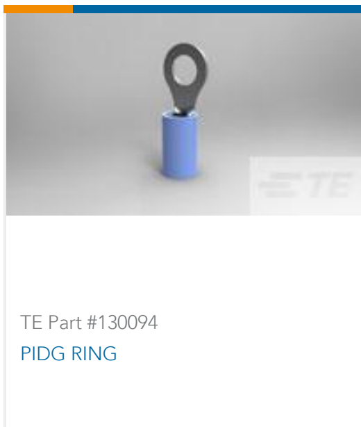
TE Part #130094 PIDG RING