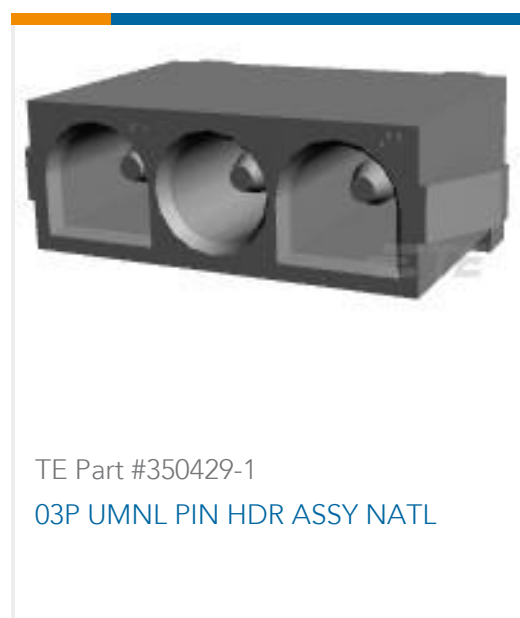
TE Part #350429-1 03P UMNL PIN HDR ASSY NATL