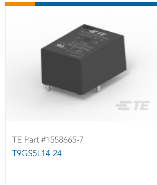
TE Part #1558665-7 T9GS5L14-24