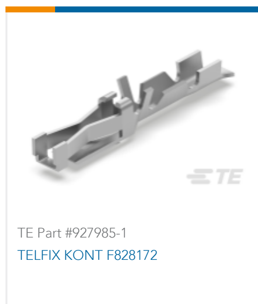
TE Part #927985-1 TELFIX KONT F828172