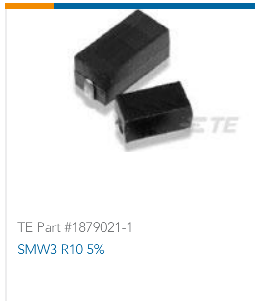
TE Part #1879021-1 SMW3 R10 5%