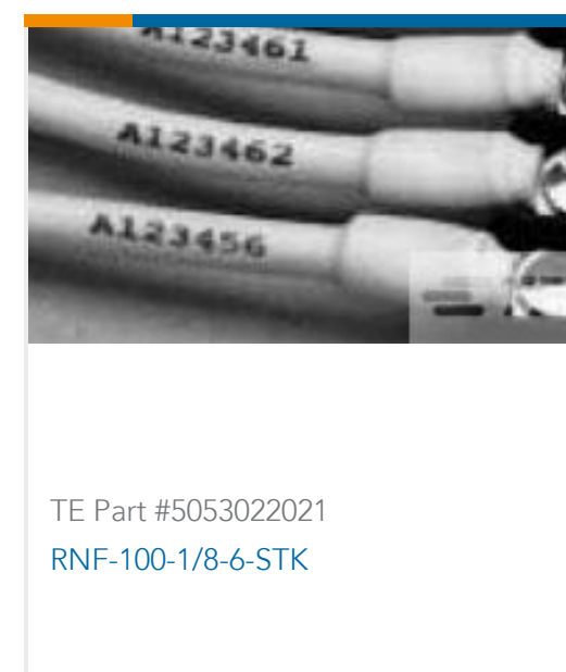
TE Part #5053022021 RNF-100-1/8-6-STK