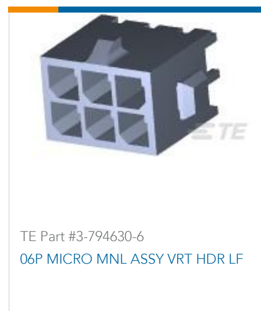
TE Part #3-794630-6 06P MICRO MNL ASSY VRT HDR LF