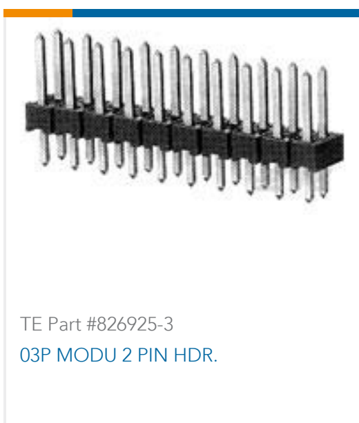
TE Part #826925-3 03P MODU 2 PIN HDR.