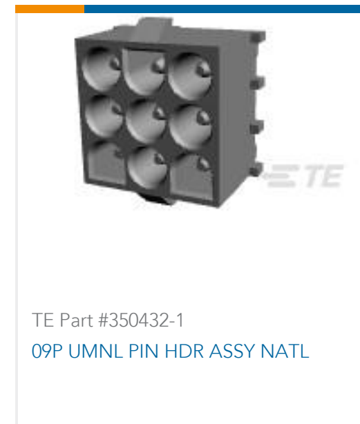
TE Part #350432-1 09P UMNL PIN HDR ASSY NATL