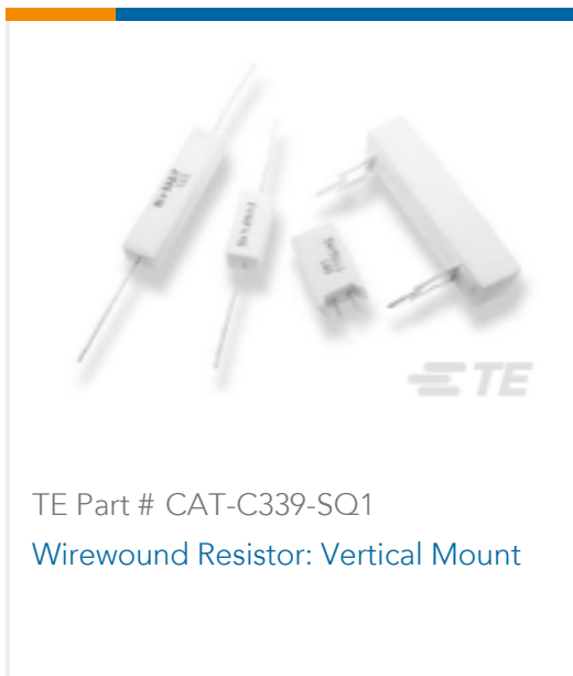
TE Part # CAT-C339-SQ1 Wirewound Resistor: Vertical Mount