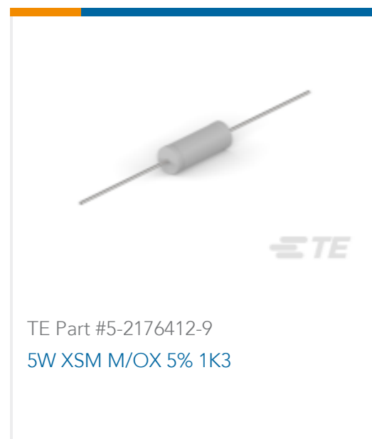
TE Part #5-2176412-9 5W XSM M/OX 5% 1K3