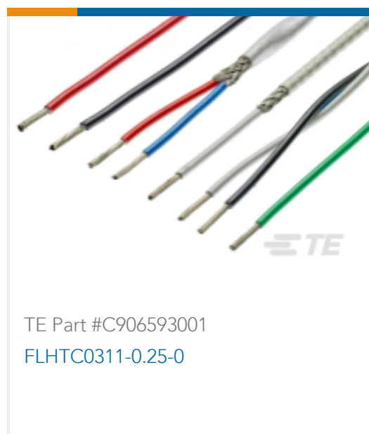
TE Part #C906593001 FLHTC0311-0.25-0