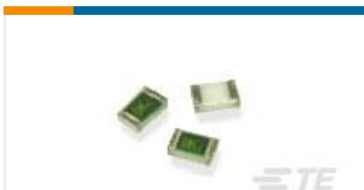
TE Part #9-1625868-2 RP 2A 0.25W 47R5 0.1% 25PPM 1K RL