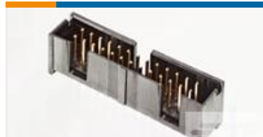
TE Part #5103308-5 A/L LOW PRO HDR 20P VERT BLACK