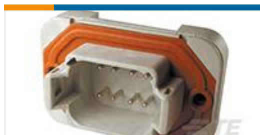
TE Part #DT15-08PA HDR, 8P, GRY, ST, NI/CU, A