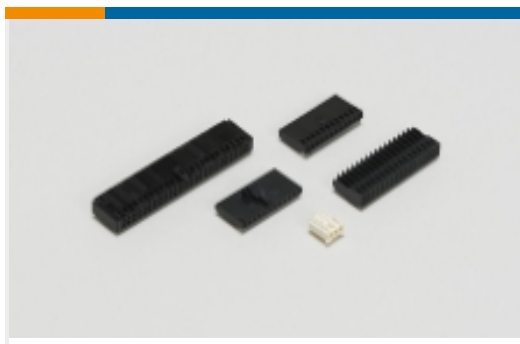
Wire-to-Board Connector Assemblies & Housings(5)