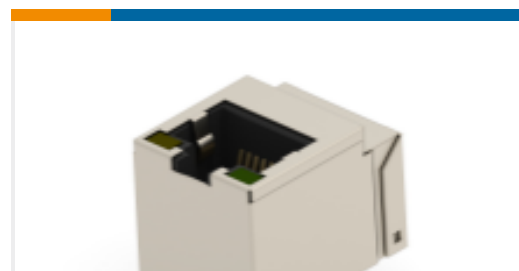
TE Part #203323-E MJIM IMV 1X1 S 88 * X R THRU * L1 M3D01