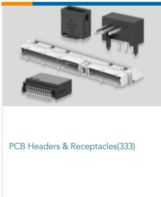
PCB Headers & Receptacles(333)