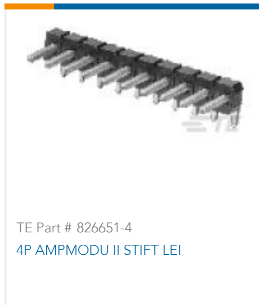
TE Part # 826651-4 4P AMPMODU II STIFT LEI