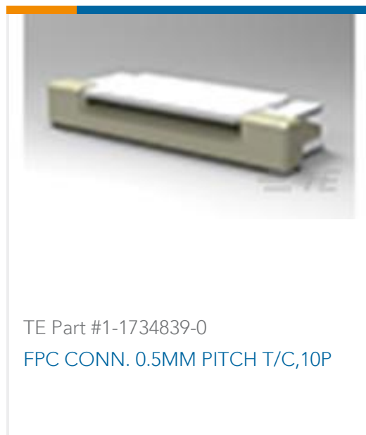
TE Part #1-1734839-0 FPC CONN. 0.5MM PITCH T/C,10P