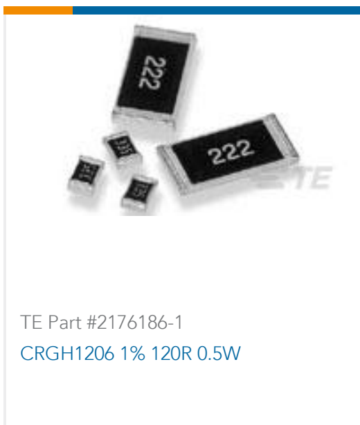
TE Part #2176186-1 CRGH1206 1% 120R 0.5W