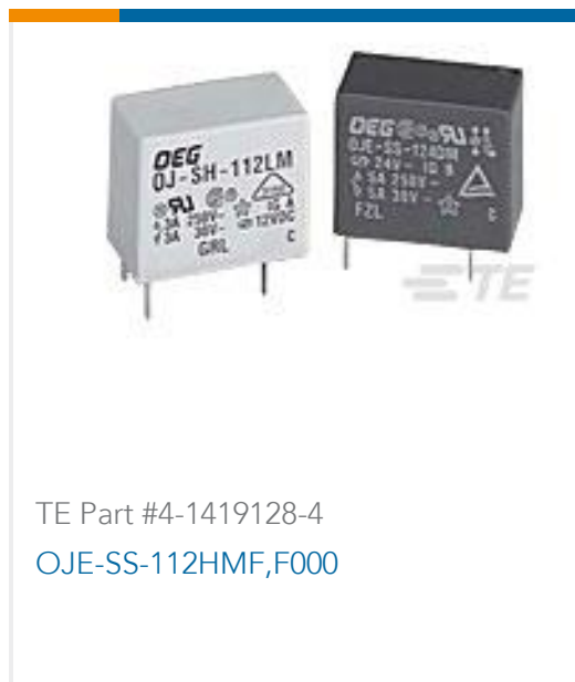
TE Part #4-1419128-4 OJE-SS-112HMF,F000