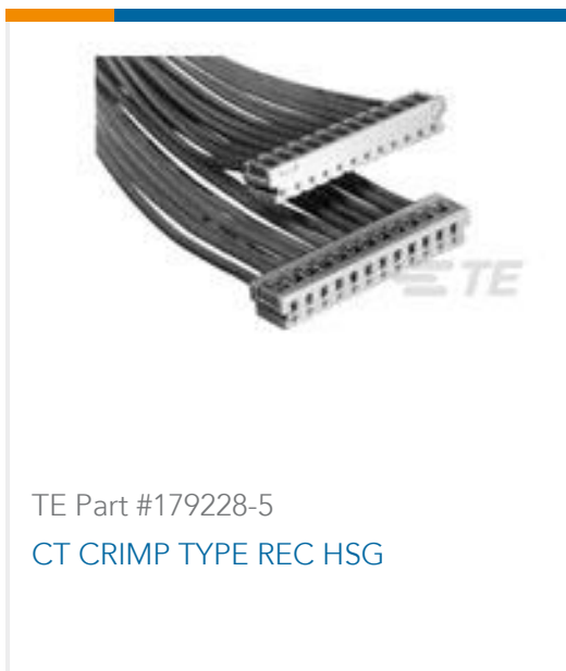
TE Part #179228-5 CT CRIMP TYPE REC HSG