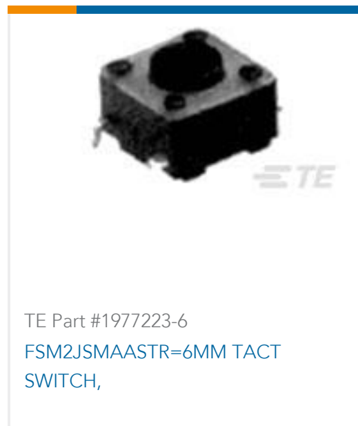
TE Part #1977223-6 FSM2JSMAASTR=6MM TACT SWITCH,