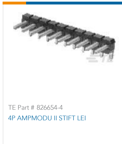
TE Part # 826654-4 4P AMPMODU II STIFT LEI