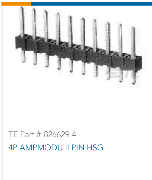
TE Part # 826629-4 4P AMPMODU II PIN HSG