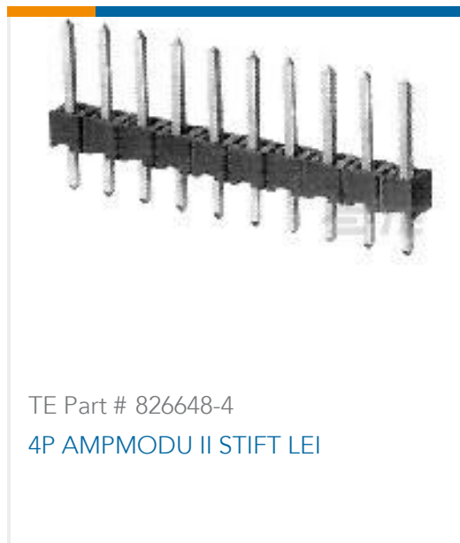
TE Part # 826648-4 4P AMPMODU II STIFT LEI