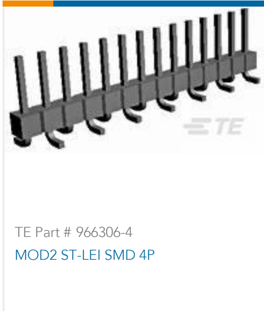
TE Part # 966306-4 MOD2 ST-LEI SMD 4P