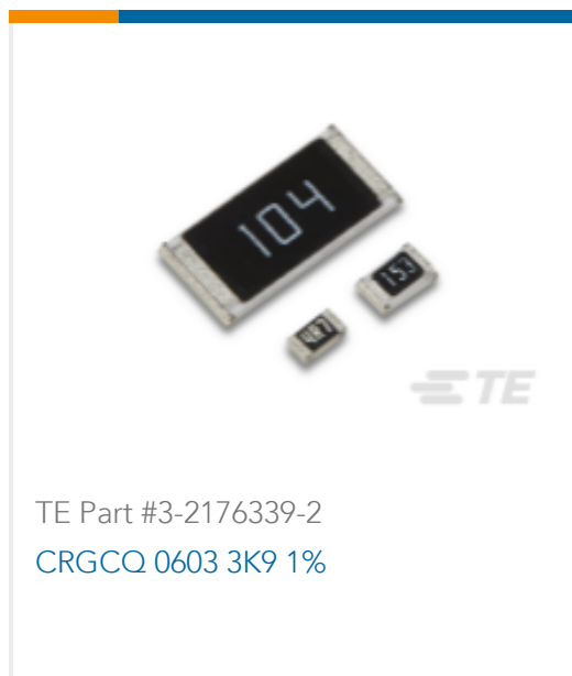
TE Part #3-2176339-2 CRGCQ 0603 3K9 1%