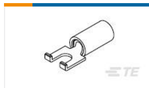
TE Part #51875-1 TERMINAL,BUDG SPD FLG 26-22 6