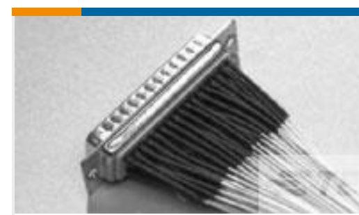
TE Part #451555J001 V4-2.0-0-SP-SM