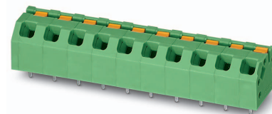
The figure shows 10-pos. standard item (without EX marking)

PCB terminal block, Push-in spring connection