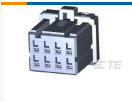
TE Part #1-1827864-4 DYNAMIC 1200D REC HSG 8P X BLACK