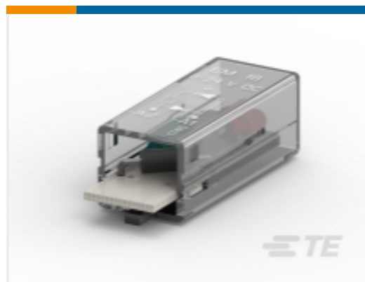
TE Part #5-1415036-1 PTML0024