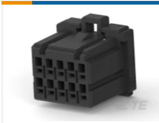
TE Part # 1-1827862-5 DYNAMIC 1100D REC HSG 10P X BLACK