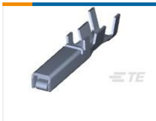
TE Part #1-175196-2 DYNAMIC D-3 REC CONT/L AU 0.38