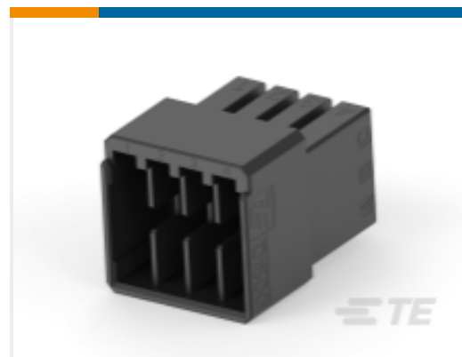
TE Part #1-2040444-4 DYNAMIC 1500T TAB HSG 12PX F/H