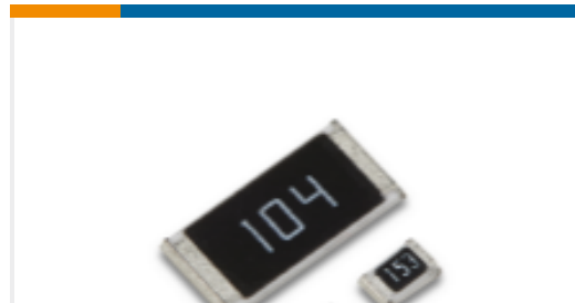
TE Part #5-2176339-1 CRGCQ 0603 150K 1%