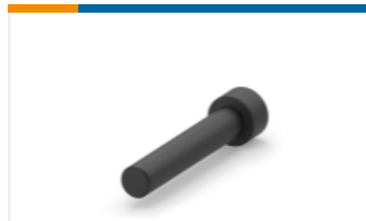
TE Part #2600048-1 BLIND CAVITY PLUG