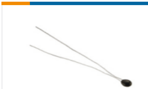
TE Part #GA10K4A1A DISCRETE 10K OHMS,+/-0.1C FROM 0C TO 70C