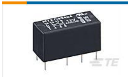
TE Part #6-1462000-2 C93432=MT Relay 550 mW 12 V