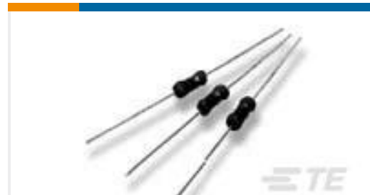
TE Part #2-1625892-8 3W SM M/OX 5% 20K