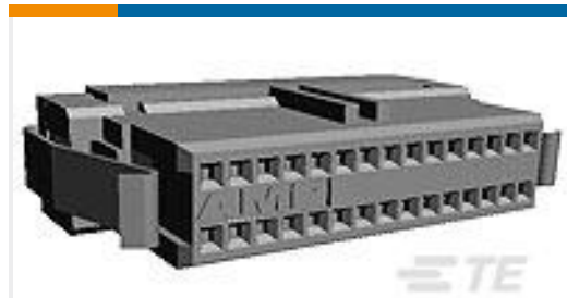
TE Part #111196-4 020 RCPT SYSTEM 50 30 DPLX