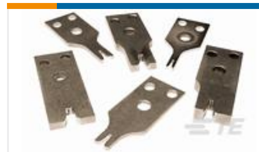
TE Part #1-1633961-2 CRIMPER, INSULATION F PREMIUM