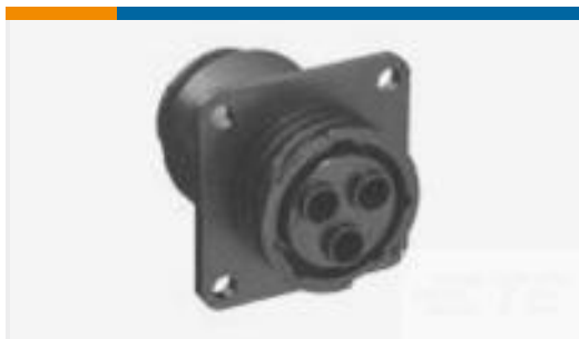
TE Part #788189-2 CPC 17-3 RCPT ASY,REV SEX