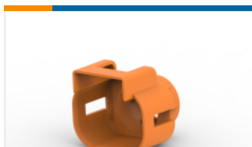
TE Part #2103013-3 CABLE SEAL RETAINER, SIZE 2, OR, HVA280