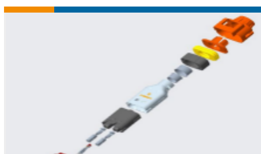
TE Part #YHV280-2PM-P-4MM-B HVA280-2pnm,pass,4sqmm,Key B