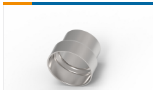
TE Part #2177090-3 STEEL,OUTER FERRULE,8MM HV, 25SQMM