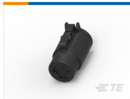
TE Part #DTHD06-1-4S PLG, 1P, BLK, N, SIZE 4