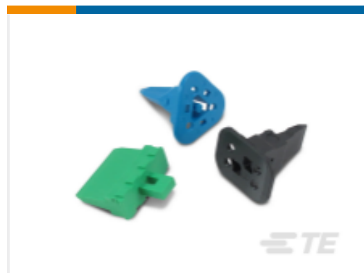
TE Part #W4SB WedgeLocks: DEUTSCH DT