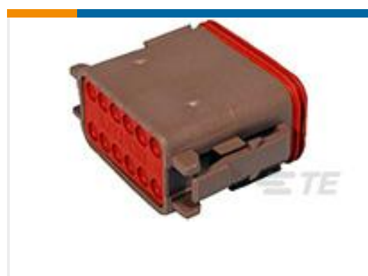
TE Part #DT06-12SD PLG, 12P, BRN, N, D