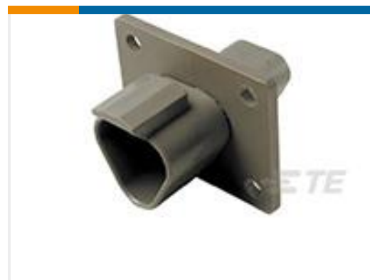
TE Part #DT04-3P-L012 REC, 3P, GRY, N, FLANGE