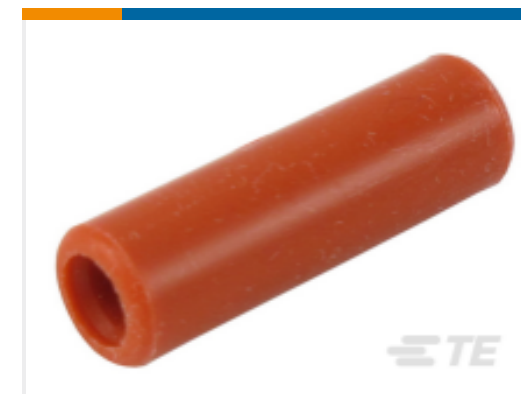
TE Part #0410-241-0406 INSERT SEAL, CRIMP SLEEVE REDUCER