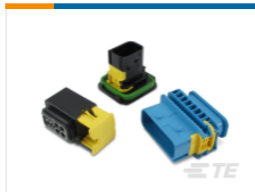
TE Part #1-1670730-1 Heavy Duty Sealed Connector Series Housings