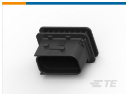
TE Part #2112302-1 PROTECTION CAP, FOR REC.HSG GROUP D