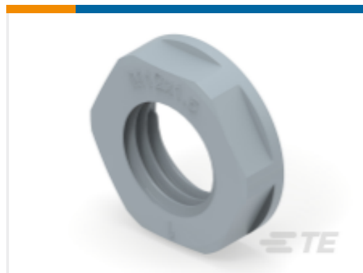
TE Part #1SNG607002R0000 EP-LN-M12-GR-A