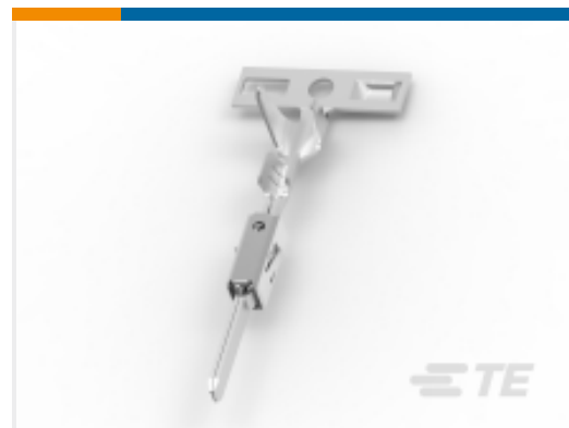
TE Part #969028-5 TAB A 1.6x0.6 CONTACT CS SWS Ag