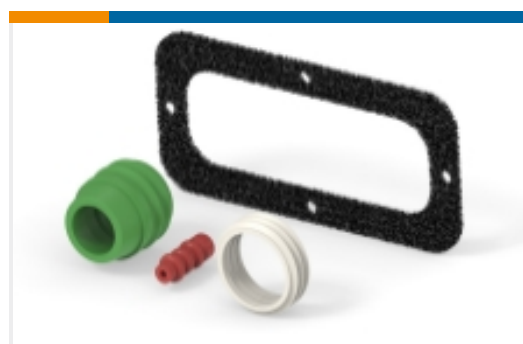
Connector Seals & Cavity Plugs(5)