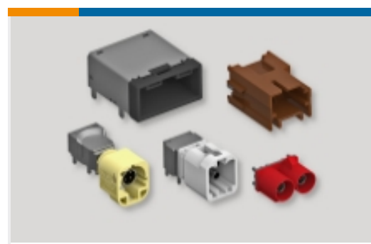
Data Connectivity Headers(2)