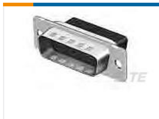
TE Part #5745883-2 PLUG ASSY,50P,HDP-20,CN