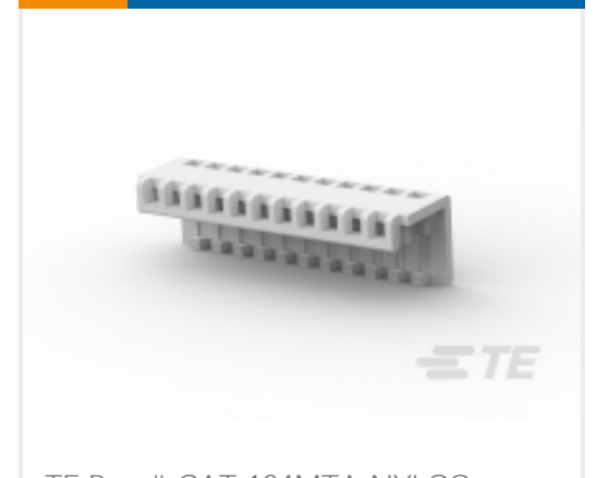
TE Part # CAT-104MTA-NYLCC Nylon PCB Connector Covers: 2.54 mm, MTA 100