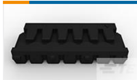
TE Part #1909783-5 WIRE TO BOARD HOUSING 1.2MM TOP ENTRY