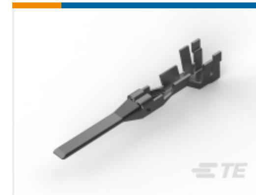
TE Part # CAT-P87024-T111 Power Double Lock Tab