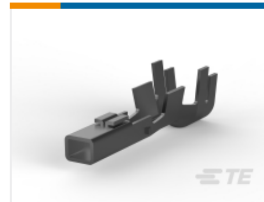
TE Part # CAT-P87024-R2435 Power Double Lock Receptacle