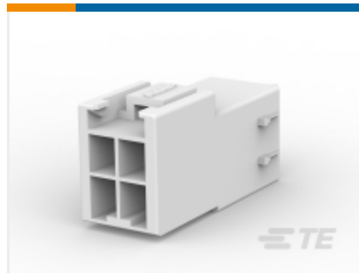
TE Part # CAT-P87024-C1701 STD Temp Power Double Lock Cap