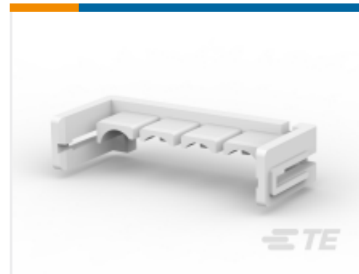
TE Part # 177920-1 POWER DBL LOCK PLATE 3.96MM 4POS