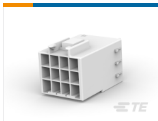
TE Part # 5-1903720-1 PDL 3.96MM PITCH CAP HSG 12P NAT (GWT)