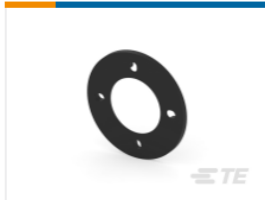
TE Part #2213626-1 GASKET, SEALING ROT DIM RECEP