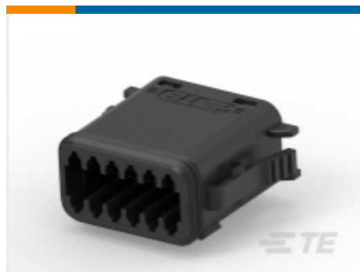
TE Part #2600043-8 12CCT PLUG BLACK K A W/LARGE SEAL