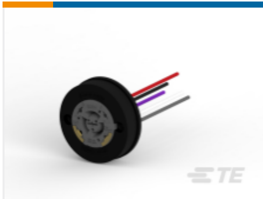
TE Part #2213627-1 ASSEMBLY, ROT DIM REC 49.22MM 5 POS 150C