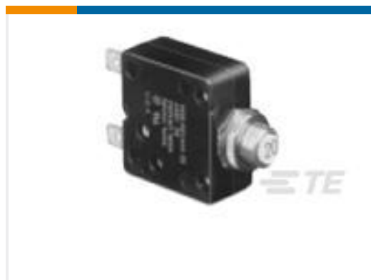
TE Part #4-1393249-6 W58-XC4C12A-30=W58