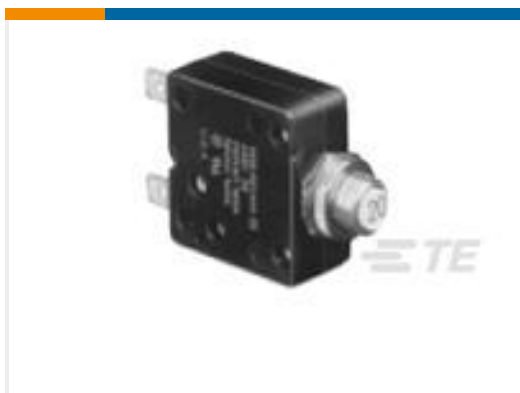
TE Part #4-1393249-3 W58-XC4C12A-20=W58