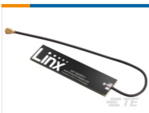
TE Part #L9000234-01 Antenna WIFI6 2.4/5/6 GHz RPC UFL 100