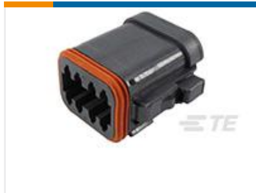
TE Part #DT06-08SB-CE01 PLG, 8P, BLK, E, CAP, B