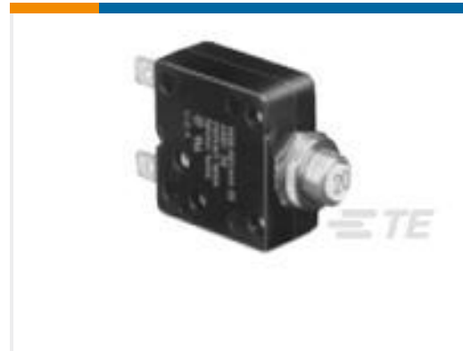
TE Part #4-1393249-1 W58-XC4C12A-15=W58