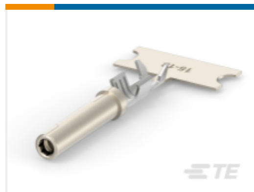
TE Part #4-2600021-3 XRC SOCKET 16-20 AWG Ni Plated