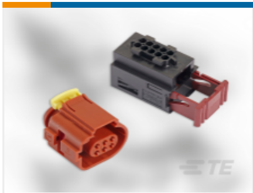
TE Part #1-967621-4 Timer Connector Housing