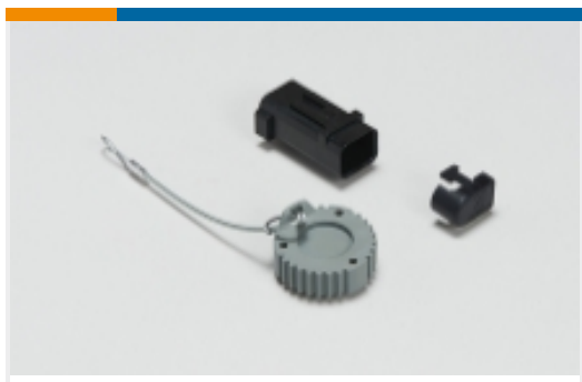
Automotive Connector Caps & Covers (4)