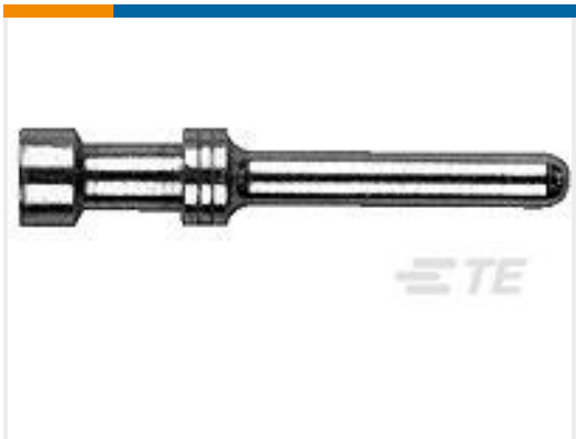
TE Part #2-1105100-1 HE/HA-C-STI.AG.0,75