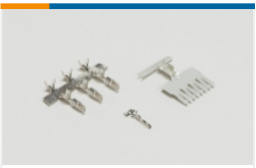
Busbars & Terminals(1)